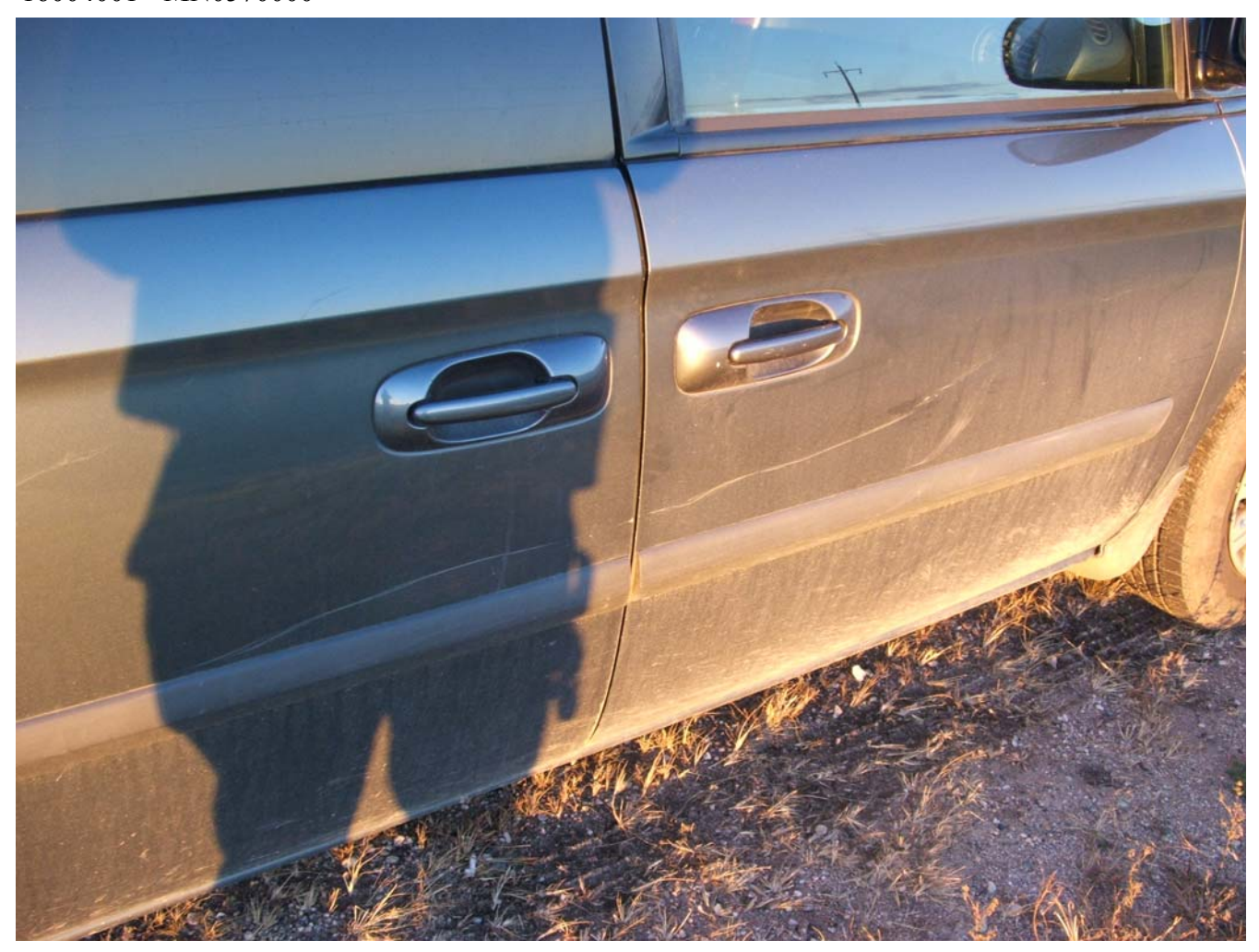
vehicle passenger side