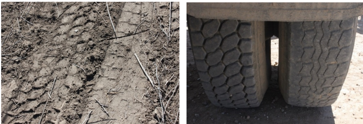
Figure 6. Tread pattern adjacent to MP 373.07; the right rear tires of the agricultural truck.

Investigators traced the tire tracks to a 2004 Kenworth International truck at Cimarron Crossing Feeders. The truck hauled flaked corn for distribution to feed bins. (See figure 5.) They observed recent damage to the truck's front bumper that was consistent with the striking of railroad ties. The front-left and front-right bumper mounting brackets were broken. The fracture faces were clean and showed no sign of oxidation, indicating a recent break. Fresh scratches and rocks consistent with the track ballast were on the bumper. Investigators examined the tire treads of the truck and matched it with the patterns observed and photographed at MP 373.07. (See figure 6.)