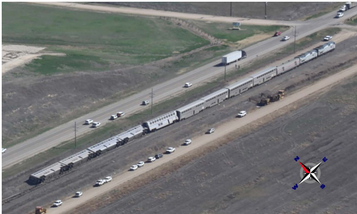
Figure 1. Accident site.

The Los Angeles-to-Chicago train, which had two locomotives and 10 cars, was operating on the La Junta Subdivision. The last four cars derailed on their sides, and two other cars derailed upright. (See figure 1.) Of the 130 passengers and 14 Amtrak employees on board, 28 were injured. Amtrak and the BNSF estimated the damages to be more than $1.4 million.