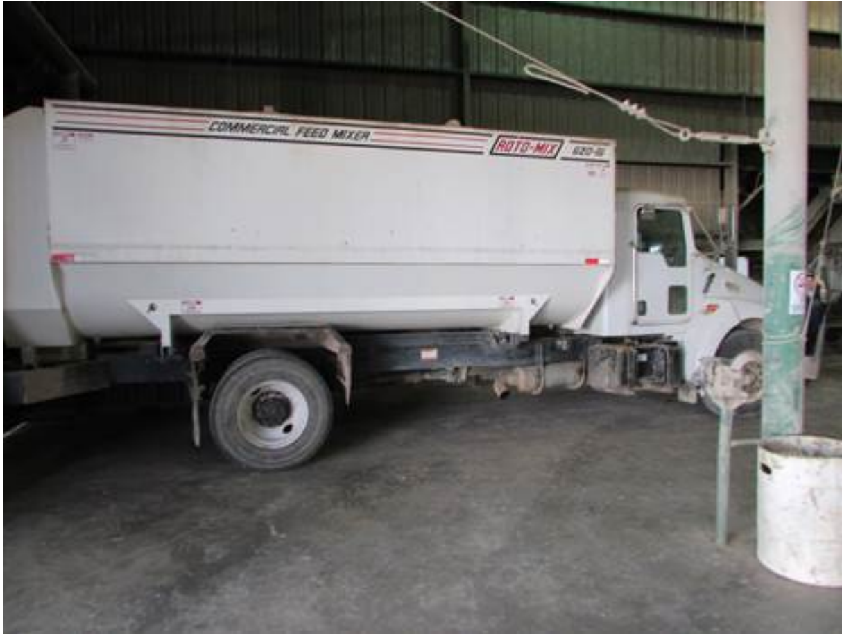
Figure 5. The 2004 Kenworth International agricultural truck that struck the BNSF track is shown parked at Cimarron Crossing Feeders.

Investigators traced the tire tracks to a 2004 Kenworth International truck at Cimarron Crossing Feeders. The truck hauled flaked corn for distribution to feed bins. (See figure 5.) They observed recent damage to the truck's front bumper that was consistent with the striking of railroad ties. The front-left and front-right bumper mounting brackets were broken. The fracture faces were clean and showed no sign of oxidation, indicating a recent break. Fresh scratches and rocks consistent with the track ballast were on the bumper. Investigators examined the tire treads of the truck and matched it with the patterns observed and photographed at MP 373.07. (See figure 6.)