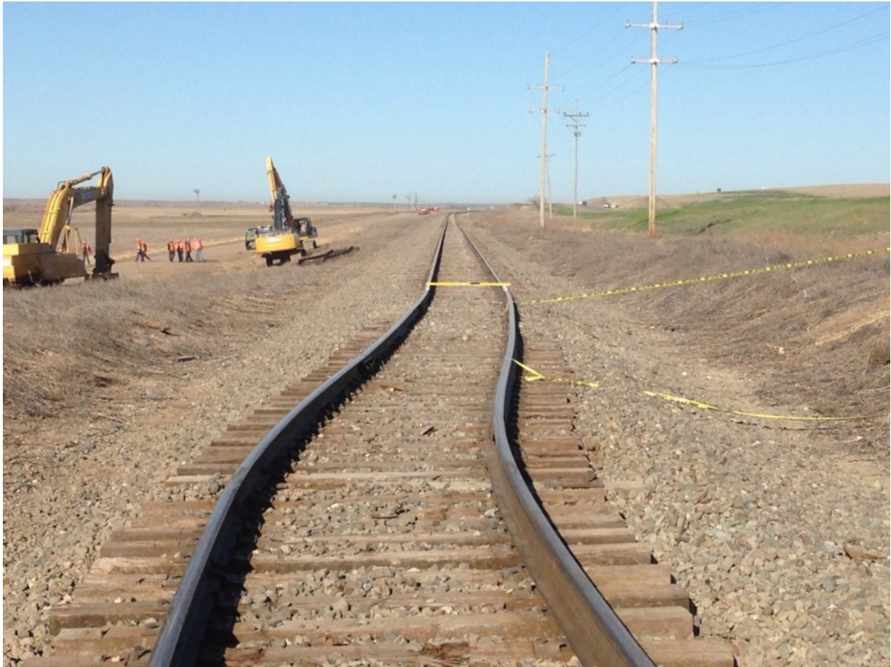
Figure 3. Looking west from the point of derailment at the misalignment (or lateral shift) of the track after the train moved over the shifted track.