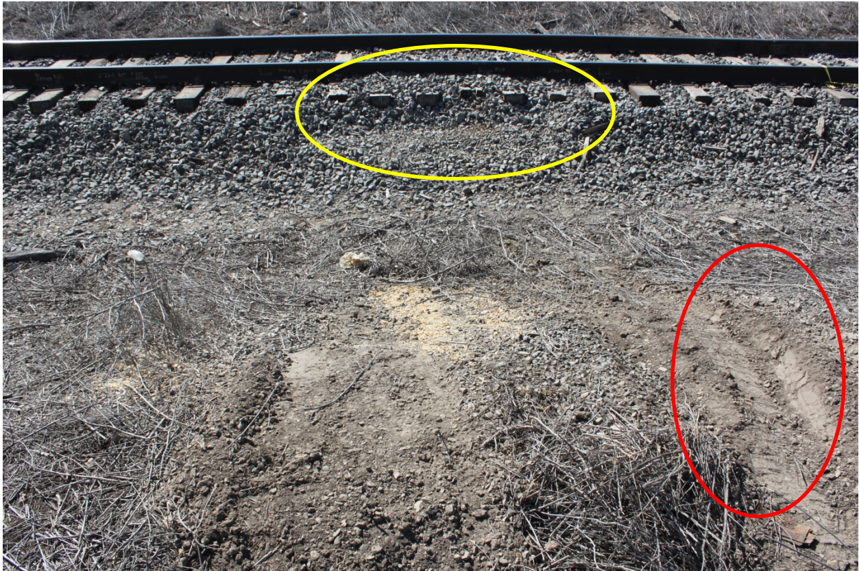
Figure 4. A red circle marks the impression from the truck's tire in the rock at the side of the tracks. The yellow circle marks the spot where the truck hit the railroad tracks.

At the scene, investigators found recent damage to the north ends of the ties at MP 373.07, recent tire marks perpendicular to the point of impact, and some cattle feed on the ground. (See figure 4.)