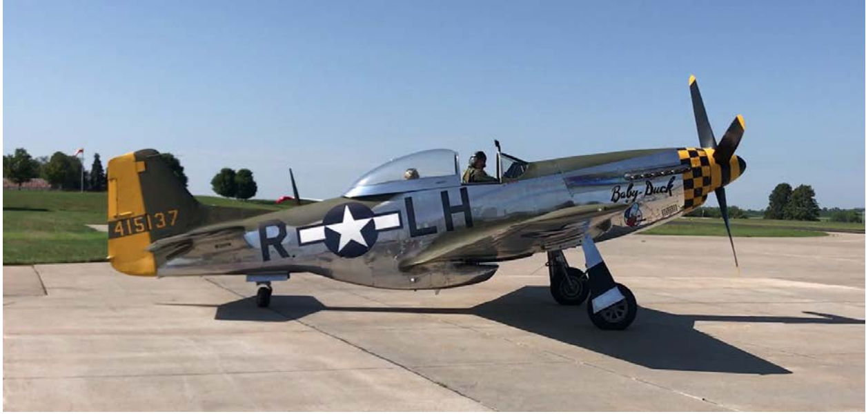
Figure 2 – P-51D, N251PW, prior to the accident