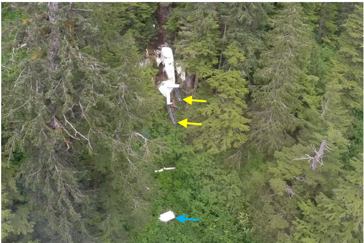
Figure 2 – Main wreckage site, aerial view