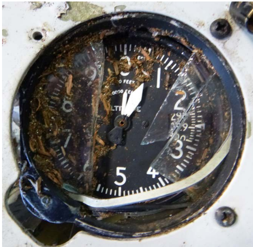
Figure 4 – Altimeter from N270PA wreckage