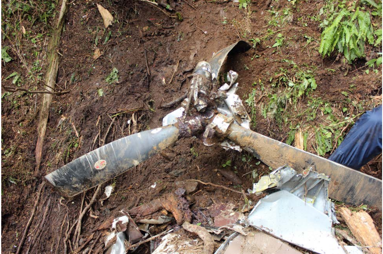
Figure 7 – HC-B3TN-3DY Propeller from N270PA