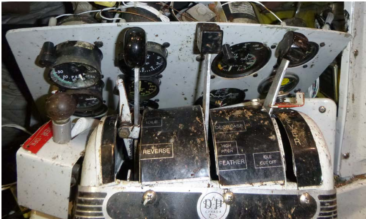
Figure 5 – Center quadrant from N270PA wreckage