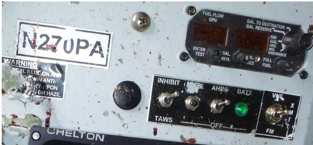
Figure 3 – Switch panel with TAWS switch from N270PA wreckage