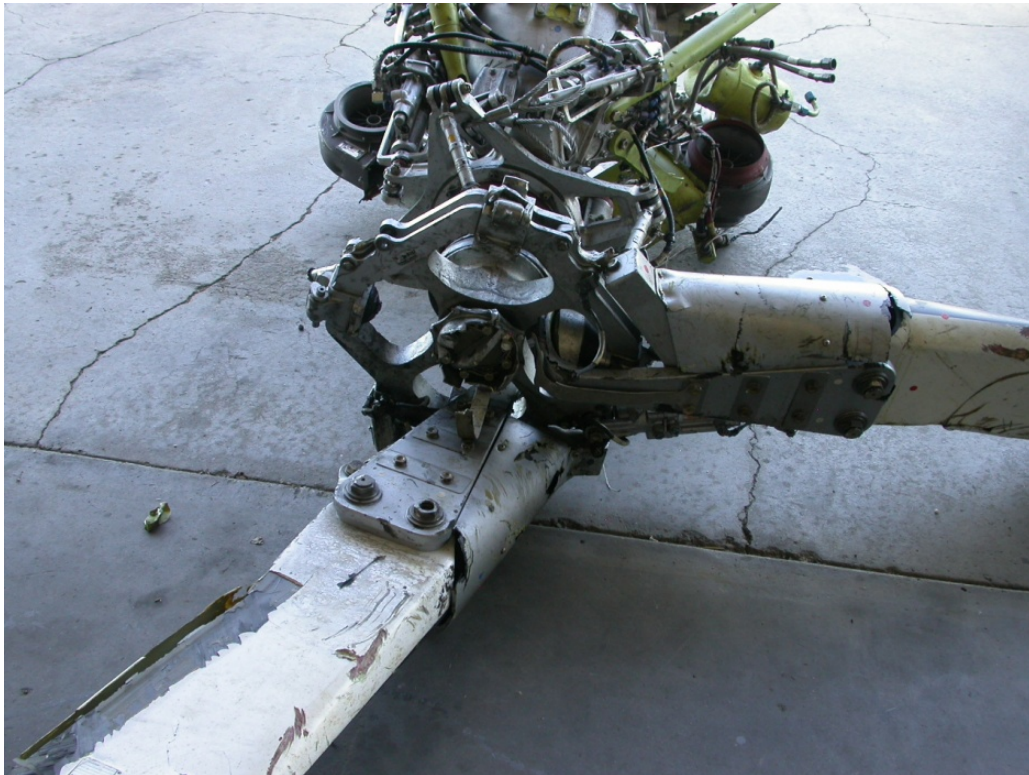
Figure 3 – Rotor Hub