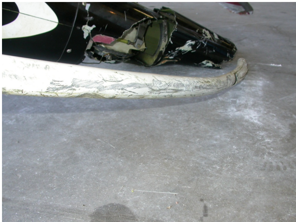
Figure 8 - Tail rotor skid tube.