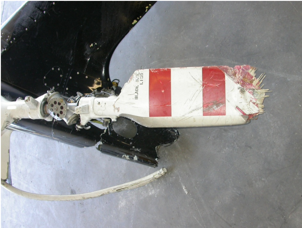
Figure 7 – Tail Rotor Blade B, Serial Number L138