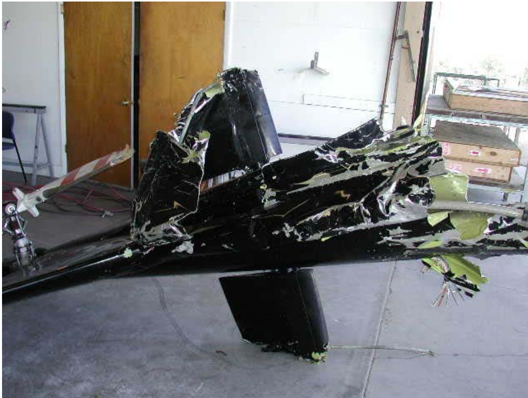
Figure 5 – Tailboom