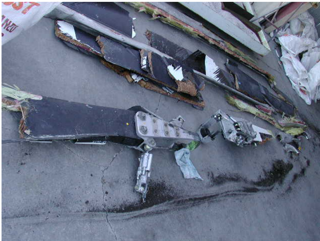
Figure 4 – Main Rotor Blade Sections