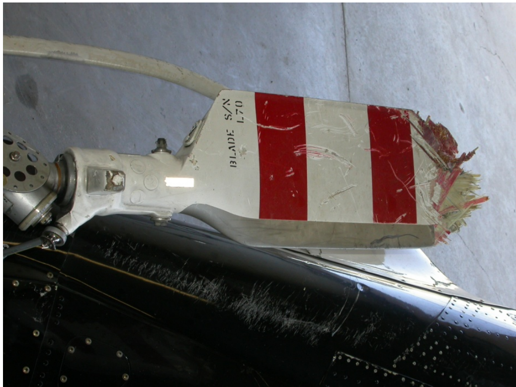
Figure 6 – Tail Rotor Blade A, Serial Number L70