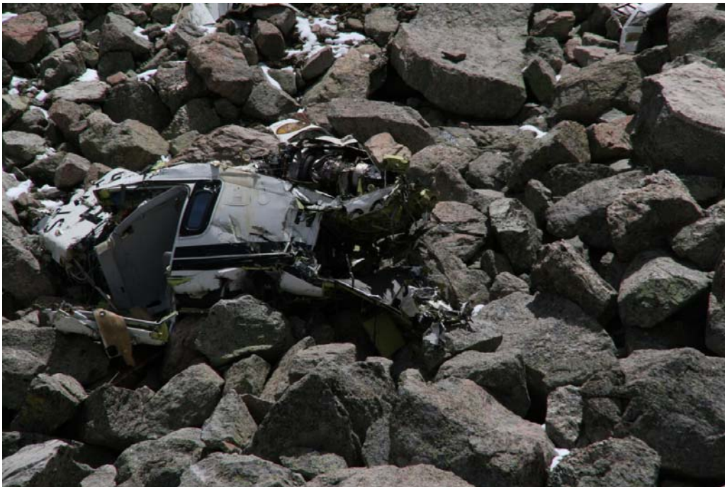
Figure 2 –Fuselage