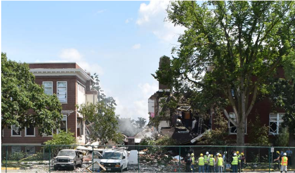
Figure 1. Photo of accident site taken after building explosion.