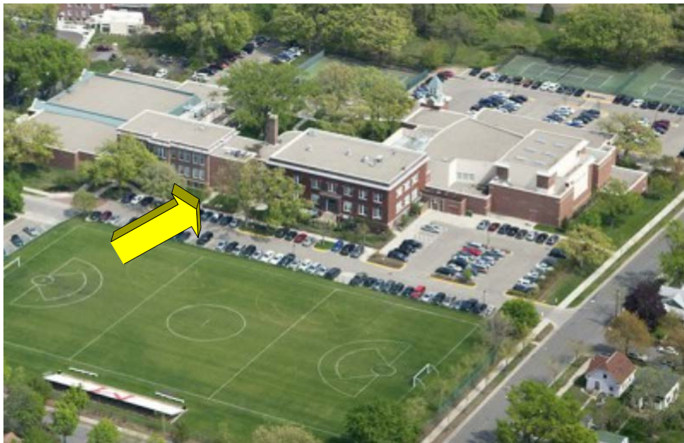
Figure 1. Photograph of north campus area at Minnehaha Academy prior to explosion.

On August 2, 2017, at 10:22 a.m., local time, a building on the north campus of the Minnehaha Academy, a private school in Minneapolis, Minnesota, was destroyed by a natural gas explosion. Figure 1 shows an aerial view of the north campus prior to the accident, with a yellow arrow pointing toward the explosion site. Figure 2 is a photograph of the accident site taken after the building explosion, with emergency responders and gas company personnel on scene. At the time of the explosion, two workers were installing piping to support the relocation of gas meters from the basement of the building to the outside. Two new meters mounted on an exterior wall were ready for the piping to be connected. While workers were removing the existing piping, a full-flow natural gas line at pressure was opened. The workers were unable to control the release of the gas; thus, they evacuated the building and warned others to evacuate. The explosion occurred during their evacuation. Two individuals were killed, and nine others were injured. 1