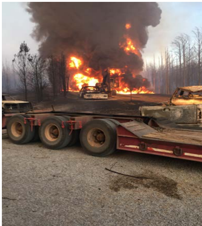
Figure 1. Ground-level view of active fire.

On October 31, 2016, at 2:47 p.m., local time, while excavating, a contractor damaged the Colonial Pipeline Company's (Colonial) 36-inch diameter refined liquid petroleum transmission pipeline, known as Line 1, near Helena, Alabama. The damage resulted in a release of gasoline from the pipeline, which ignited and burned for several days. Two excavation crew workers died, and four other workers were injured. The photographs in Figures 1 and 2 show the equipment and environmental damage that resulted from the fire. Figure 1 is a ground-level view of the ongoing fire and equipment damage that occurred from the gasoline release. Figure 2 is an aerial view of the excavated Line 1 pipeline and accident-related environmental damage taken during the postaccident investigation. 1