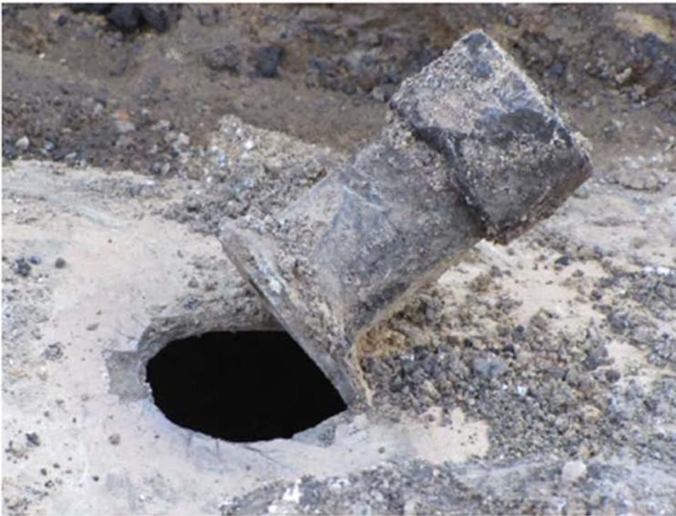
Figure 4. Close-up photo of base of damaged TOR fitting and breach in pipe at point of TOR attachment to pipe.

in the accident. Figure 4 shows a close-up view of the base of the damaged TOR fitting and the breach in the pipe at the point of the TOR attachment to the pipe surface.