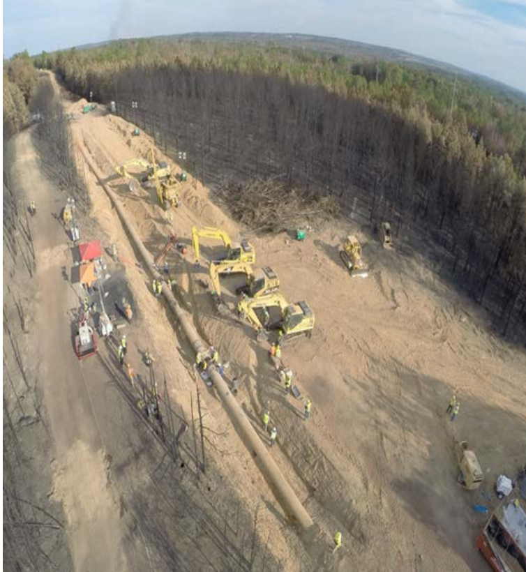
Figure 2. Aerial view of environmental damage.