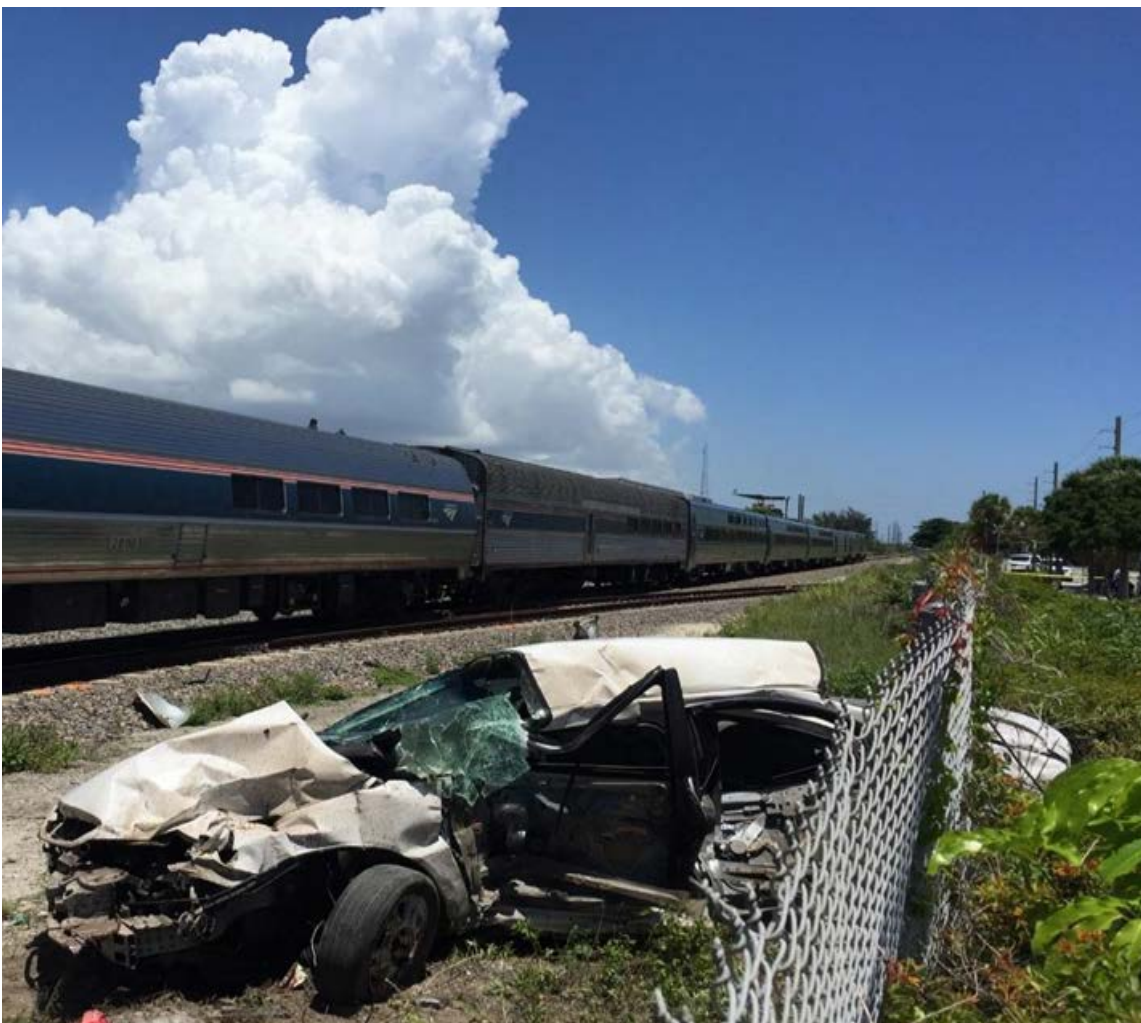
Figure 1. The struck vehicle.

At the grade crossing, 25th Street is a four-lane street; it has two eastbound and two westbound traffic lanes. The automobile was traveling westbound in the outer traffic lane when it entered the highway-rail grade crossing. About 9:59:30 a.m., the engineer saw the automobile enter the grade crossing and activated the locomotive horn (the crossing was in a quiet zone) and initiated emergency braking. 3 About 1 second prior to the collision, the lights and bells of the crossing warning system activated; however, the gates remained in the upright position. The train struck the automobile at about 48 mph. The first responders transported the automobile driver to a hospital in West Palm Beach, Florida.