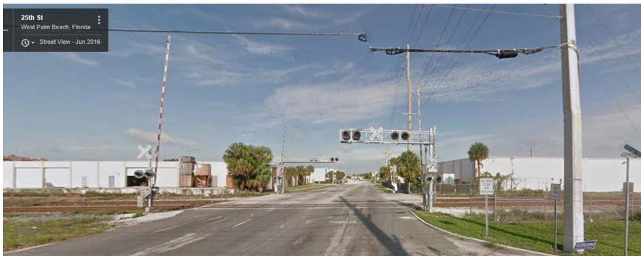
Figure 3. 25th Street crossing.

The 25th Street crossing in West Palm Beach, Florida is on the northern end of the 72-mile SFRTA rail corridor. (See figure 3.) Three tracks (two main and one industry) traverse the grade crossing in a north-south direction.