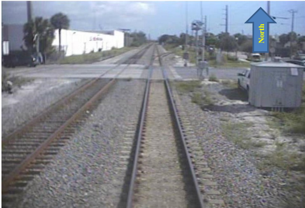
Figure 2. Photo from the locomotive video showing the grade crossing with gates in the upright position.