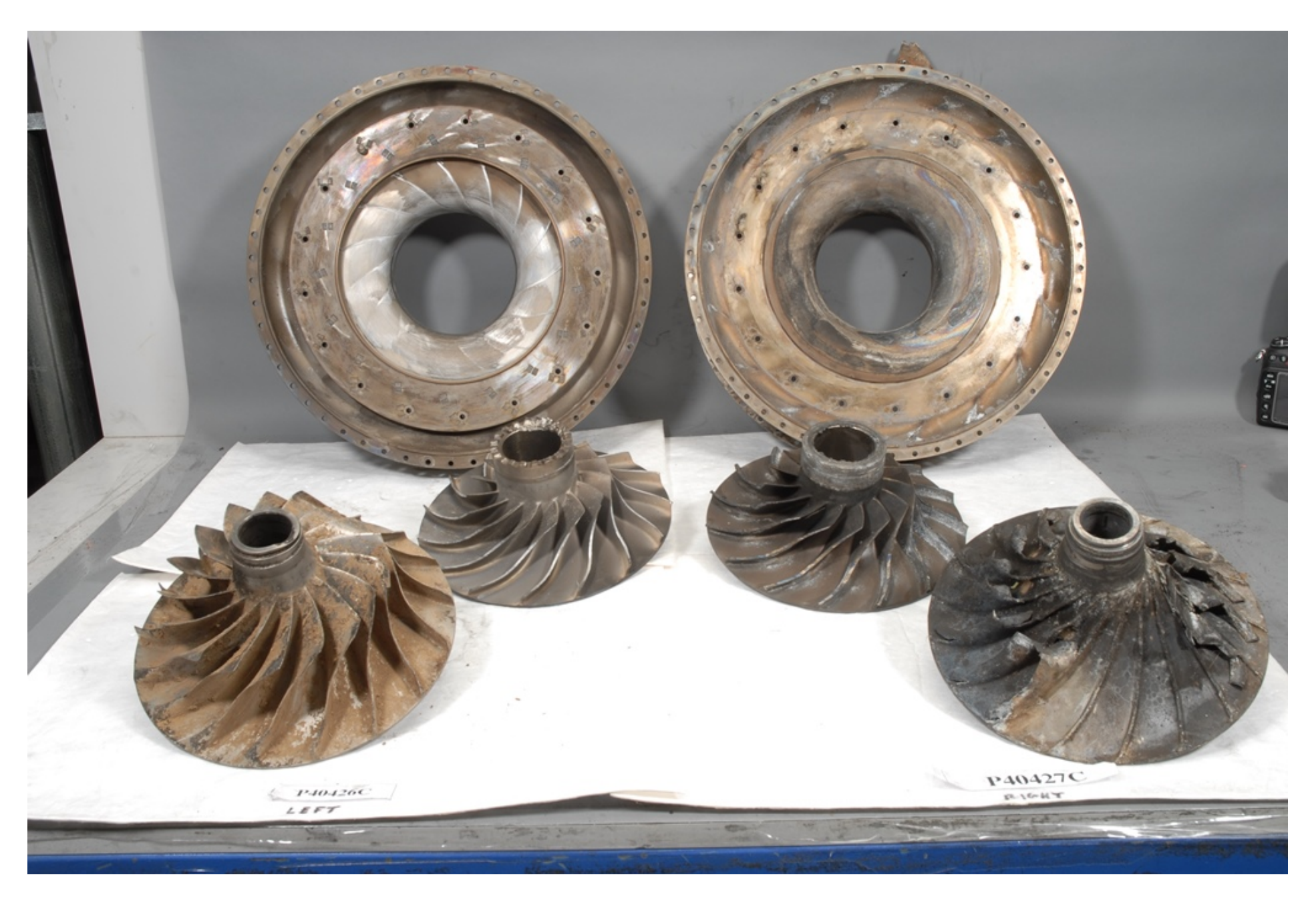
Photo 11 – Left and right engine compressor stages and compressor housings