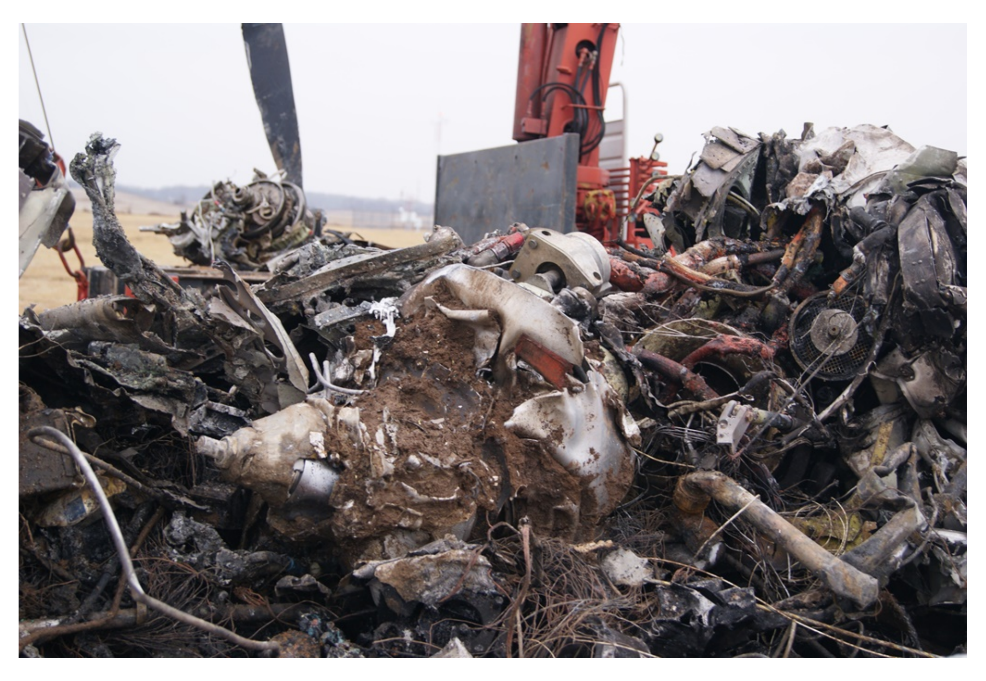
Photo 7 – View of left engine after recovery from the accident site