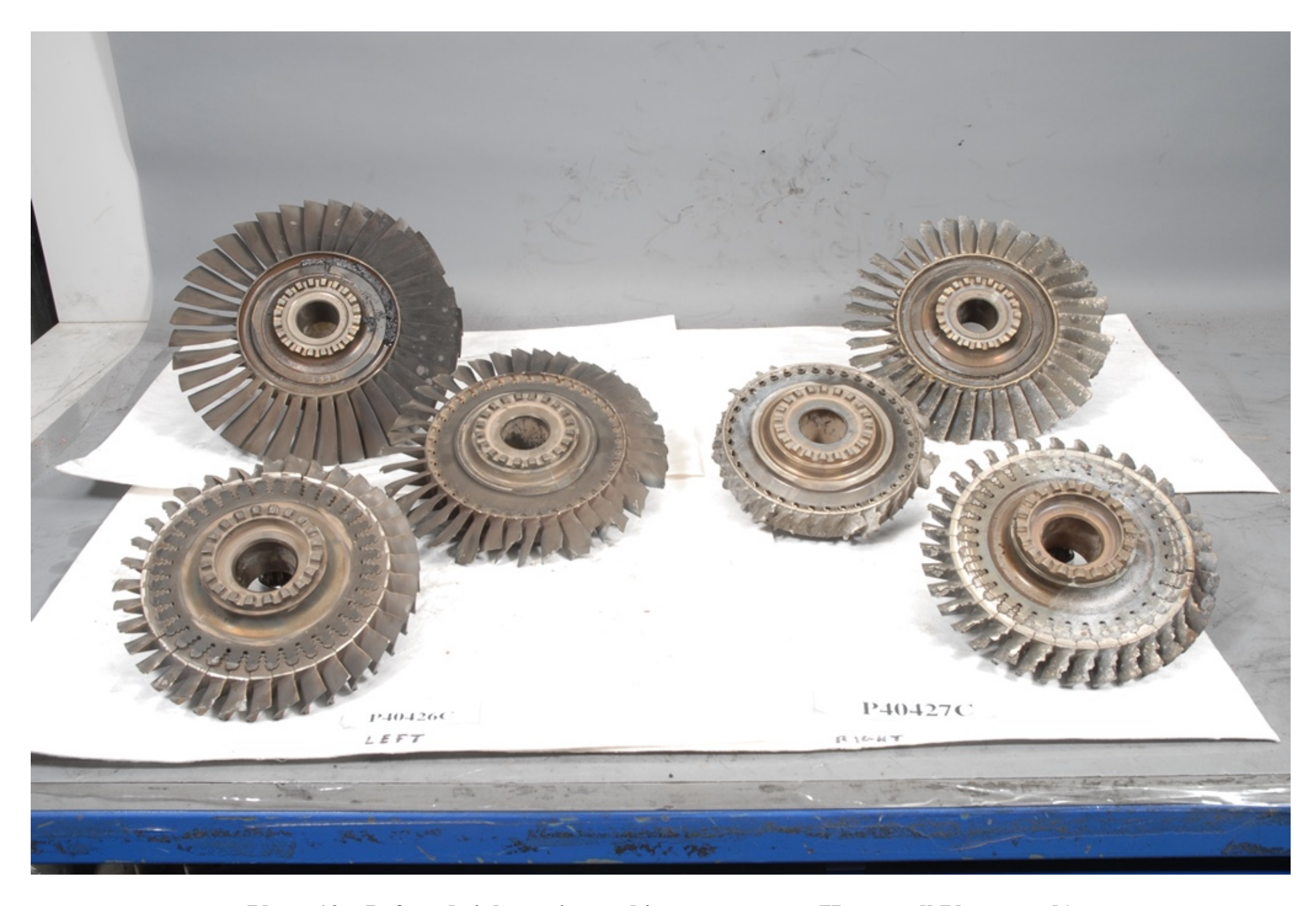
Photo 12 – Left and right engine turbine rotor stages