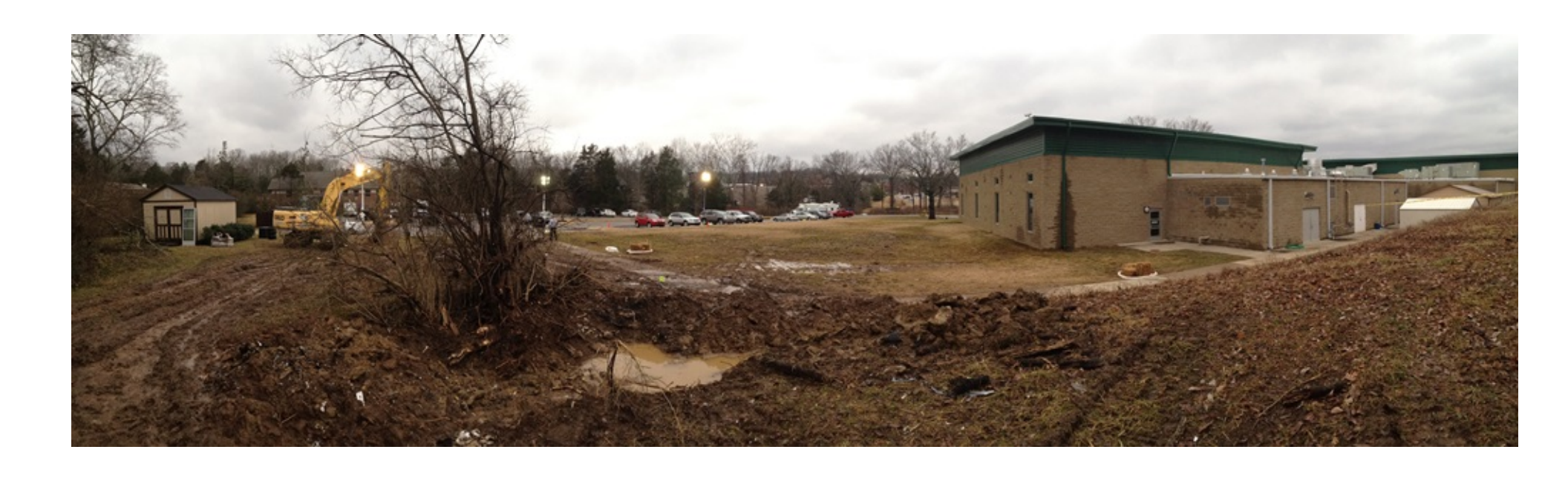
Photo 4 – Panoramic view of accident site from main impact crater after wreckage recovery