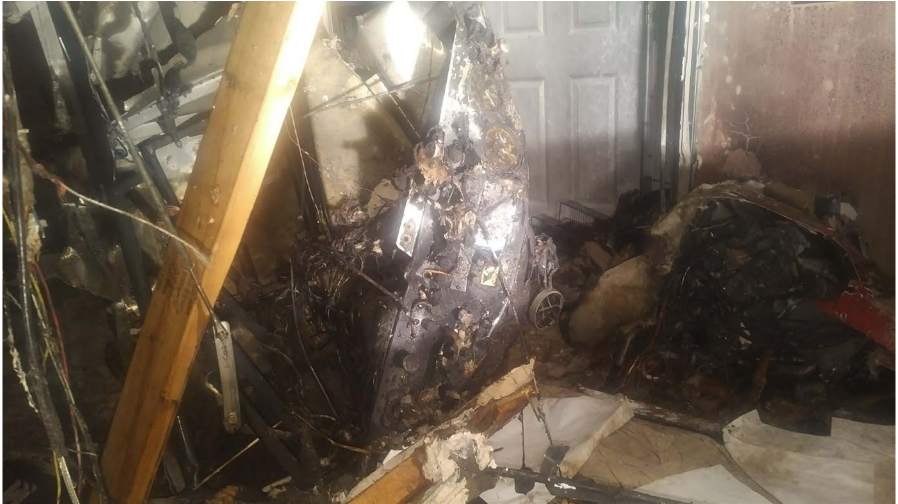
Photo 3 – View of damaged instrument panel and engine inside condominium room.