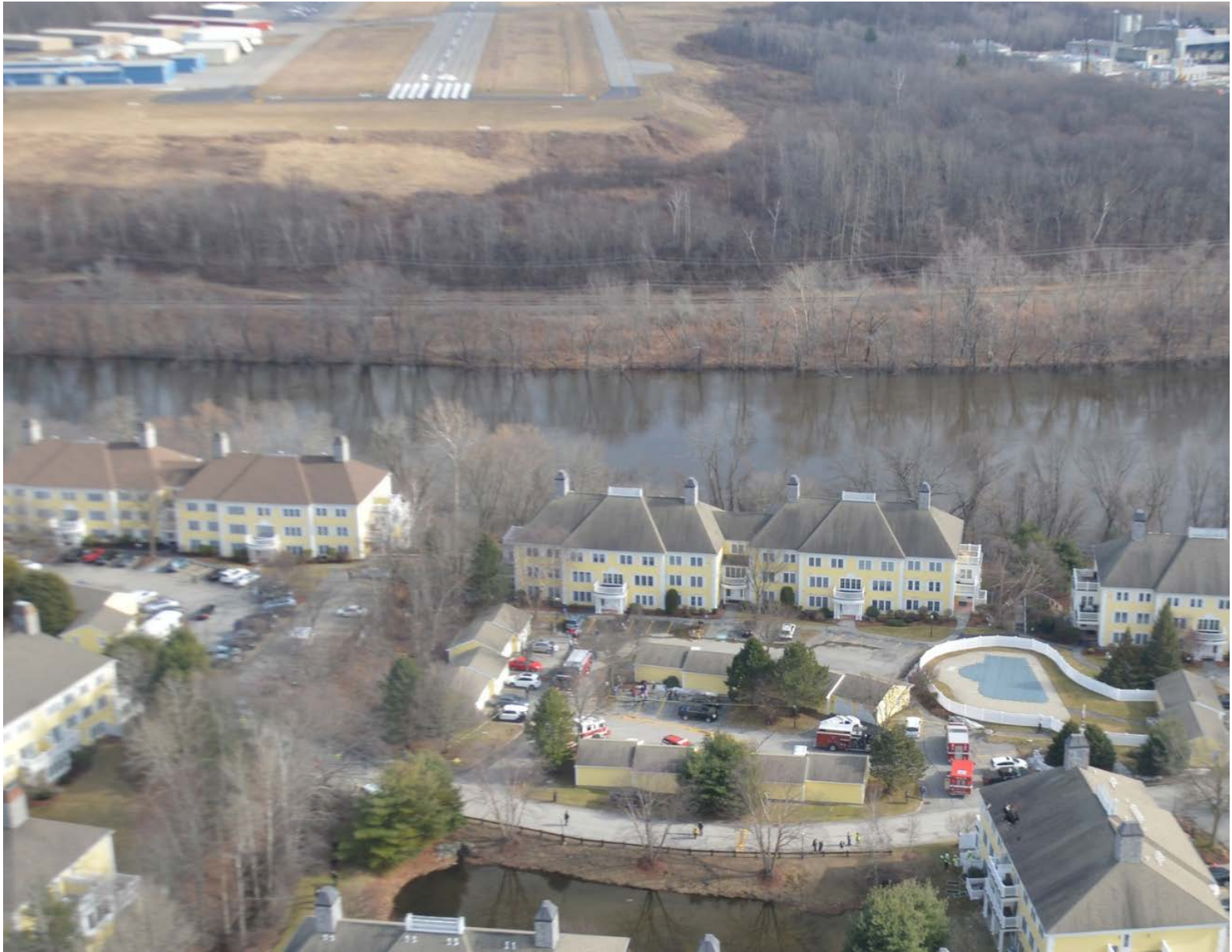
Photo 1 – Aerial view of airplane in roof of condominium-bottom right. Note airport in background.