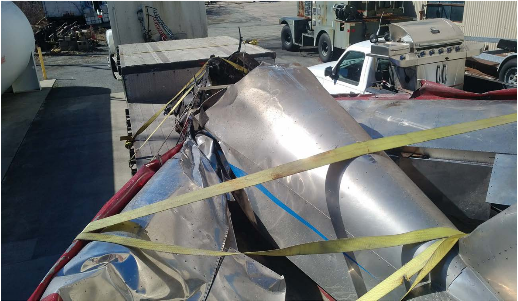
Photo 6 – Aft quarter view of airplane looking forward- showing wings and fuselage damage.