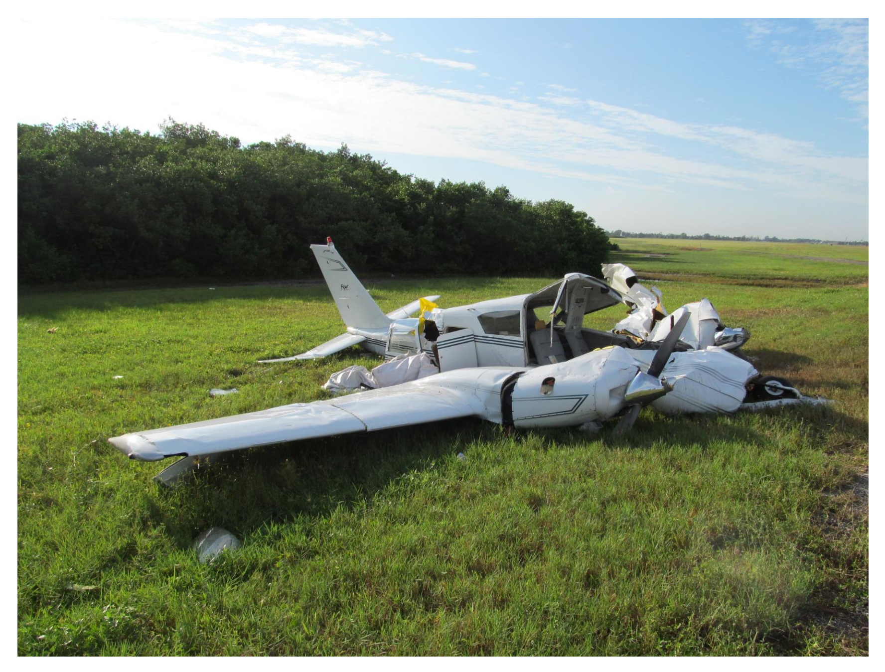
Photo 3 – Right Front Quarter of Airplane Looking At Right Engine, Propeller and Fuselage