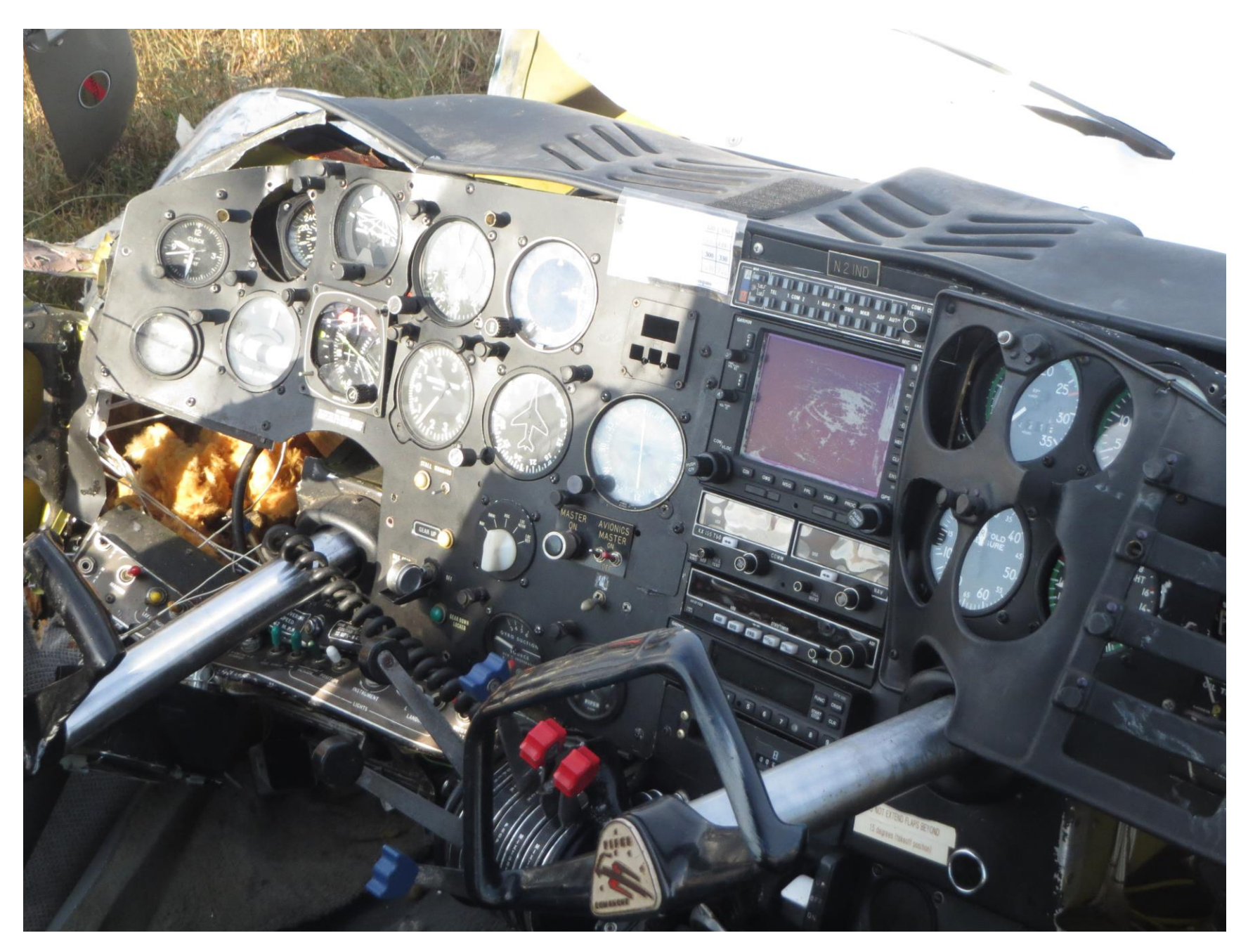
Photo 4 – Instrument Panel, Control Columns, Throttle, Propeller and Mixture Levers