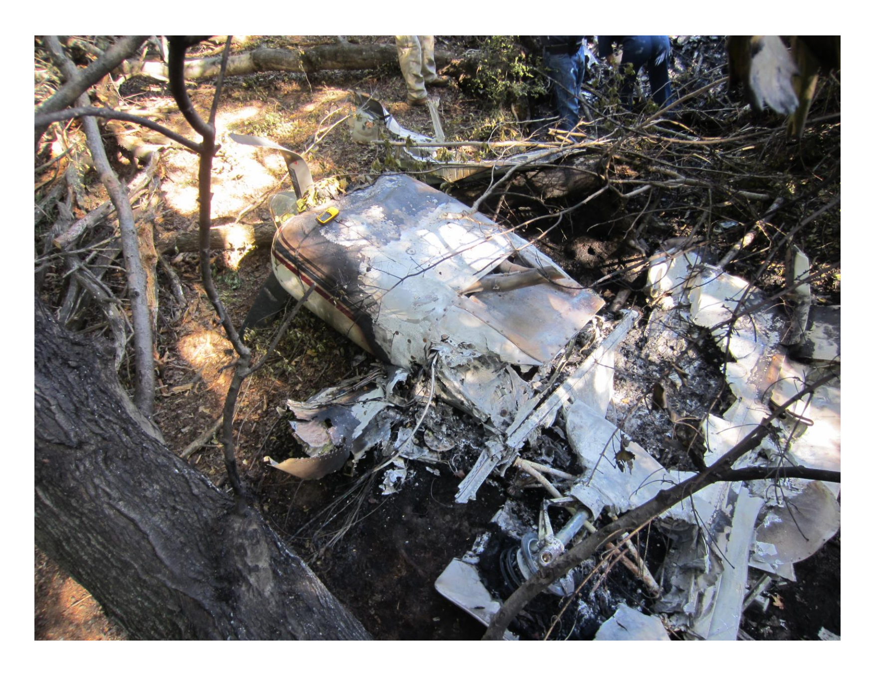
Photo 3 – Left engine, propeller and wing damage. The entire assembly is upside down.