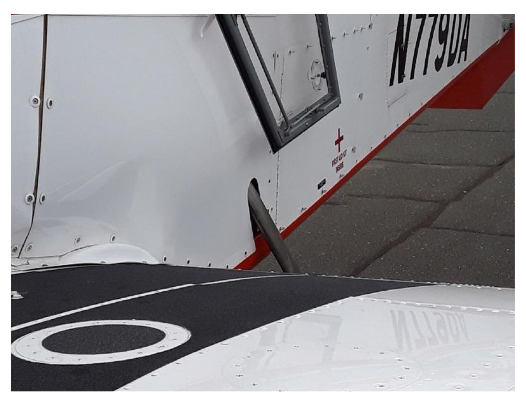
Photo 1 – View of left rear wing root