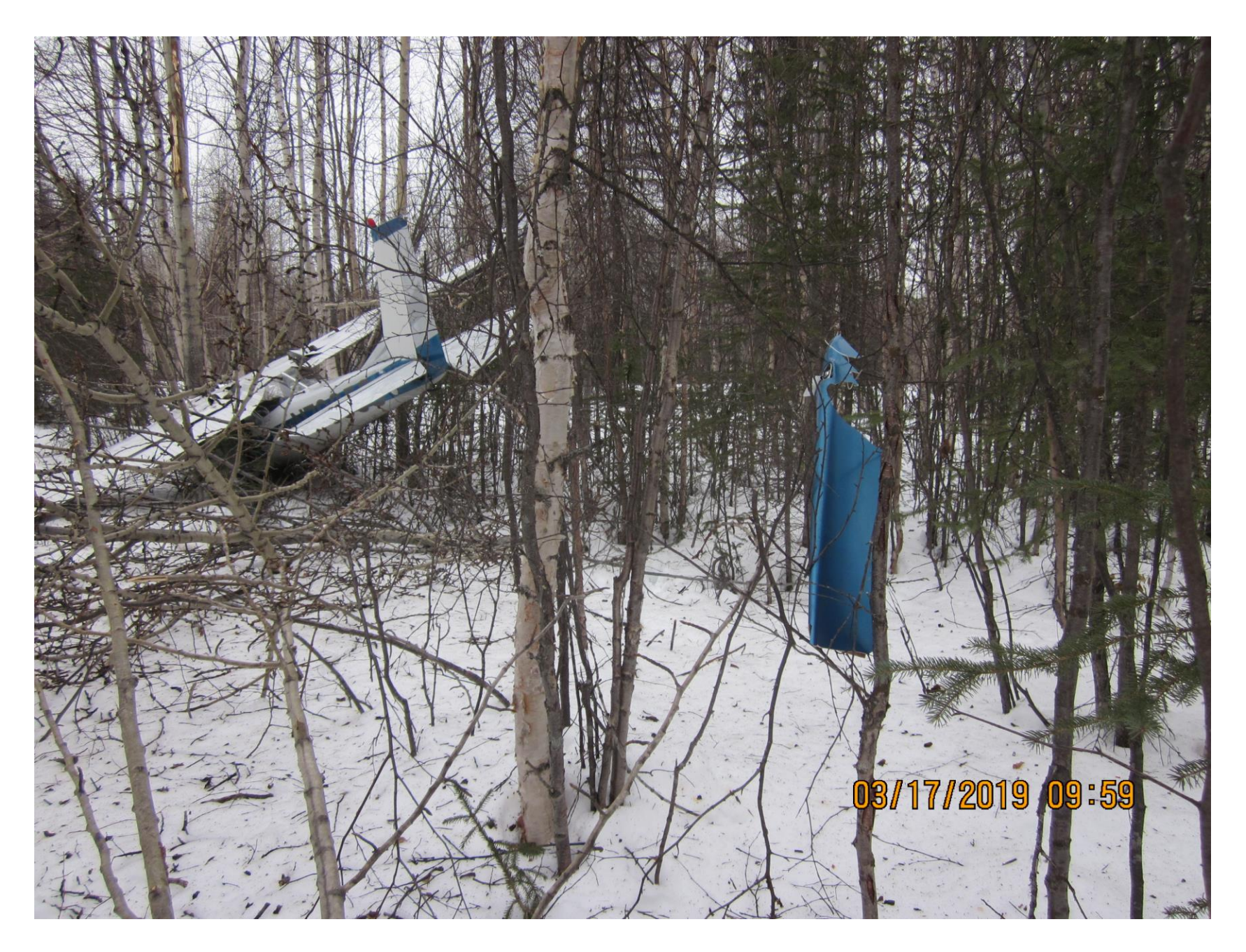
Photo 2 - Rear view of accident airplane