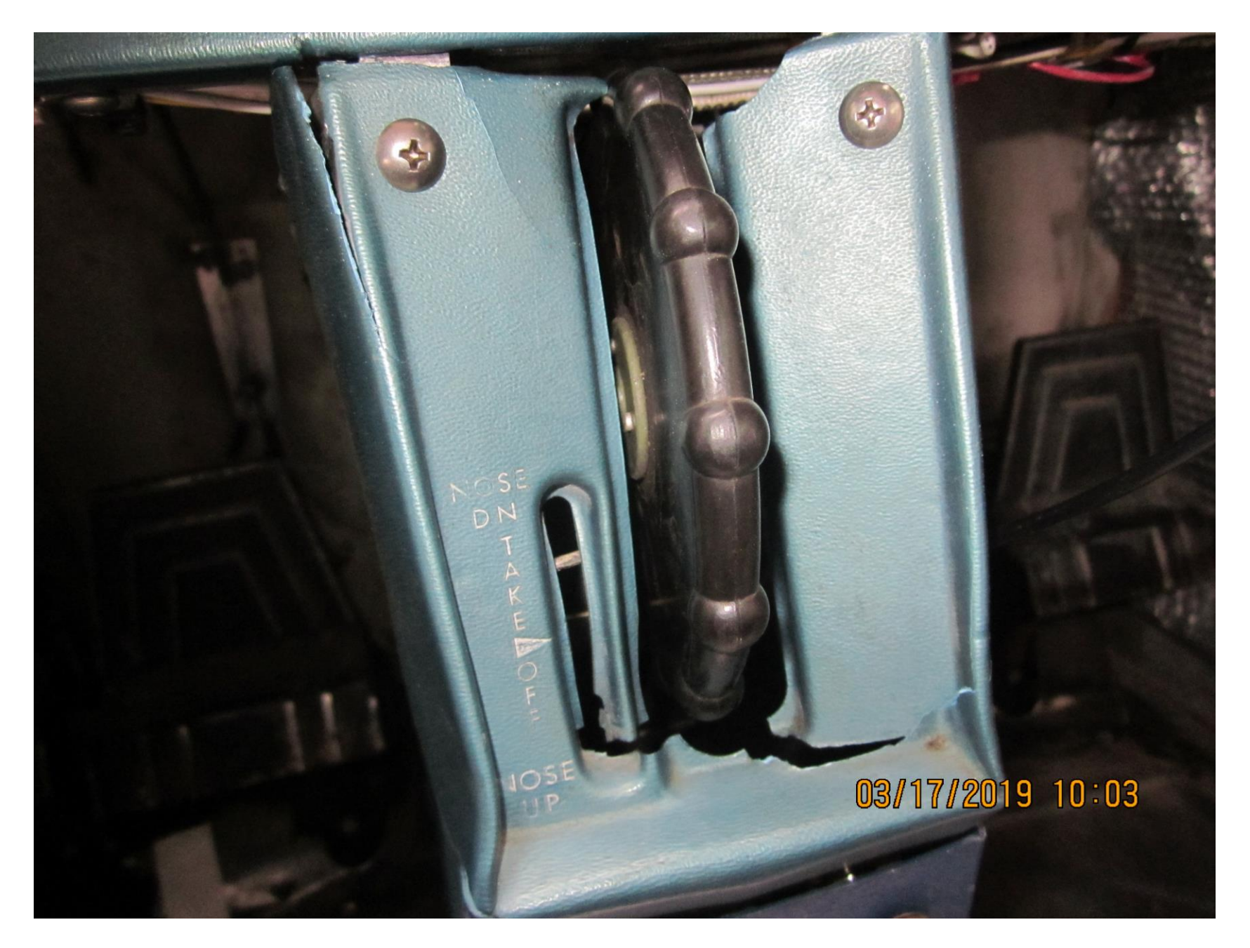
Photo 3 – View of airplane trim at the accident site