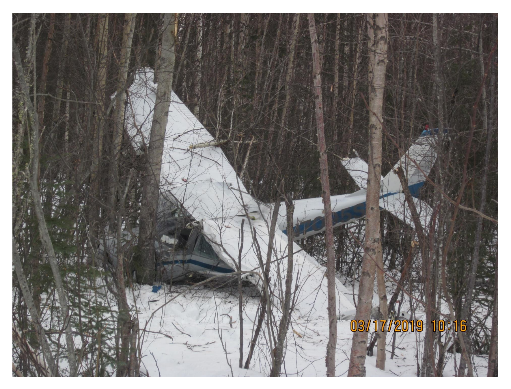
Photo 1 – View of accident airplane and damaged wings