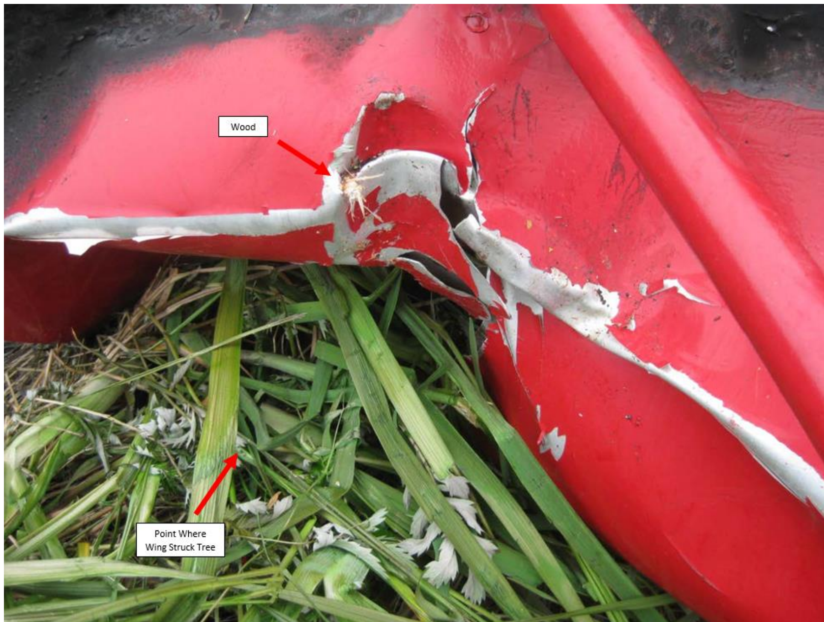
Photo 5 – Wing damage from tree impact