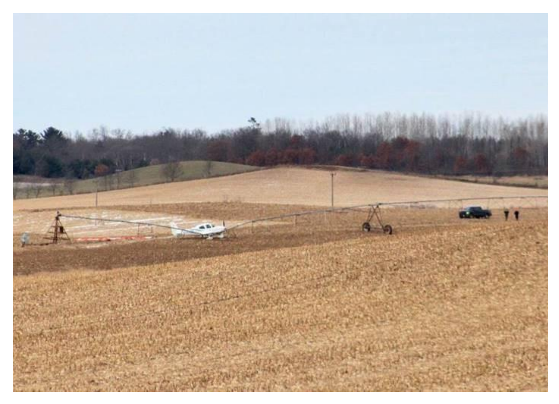
Photo 1 – View of accident airplane