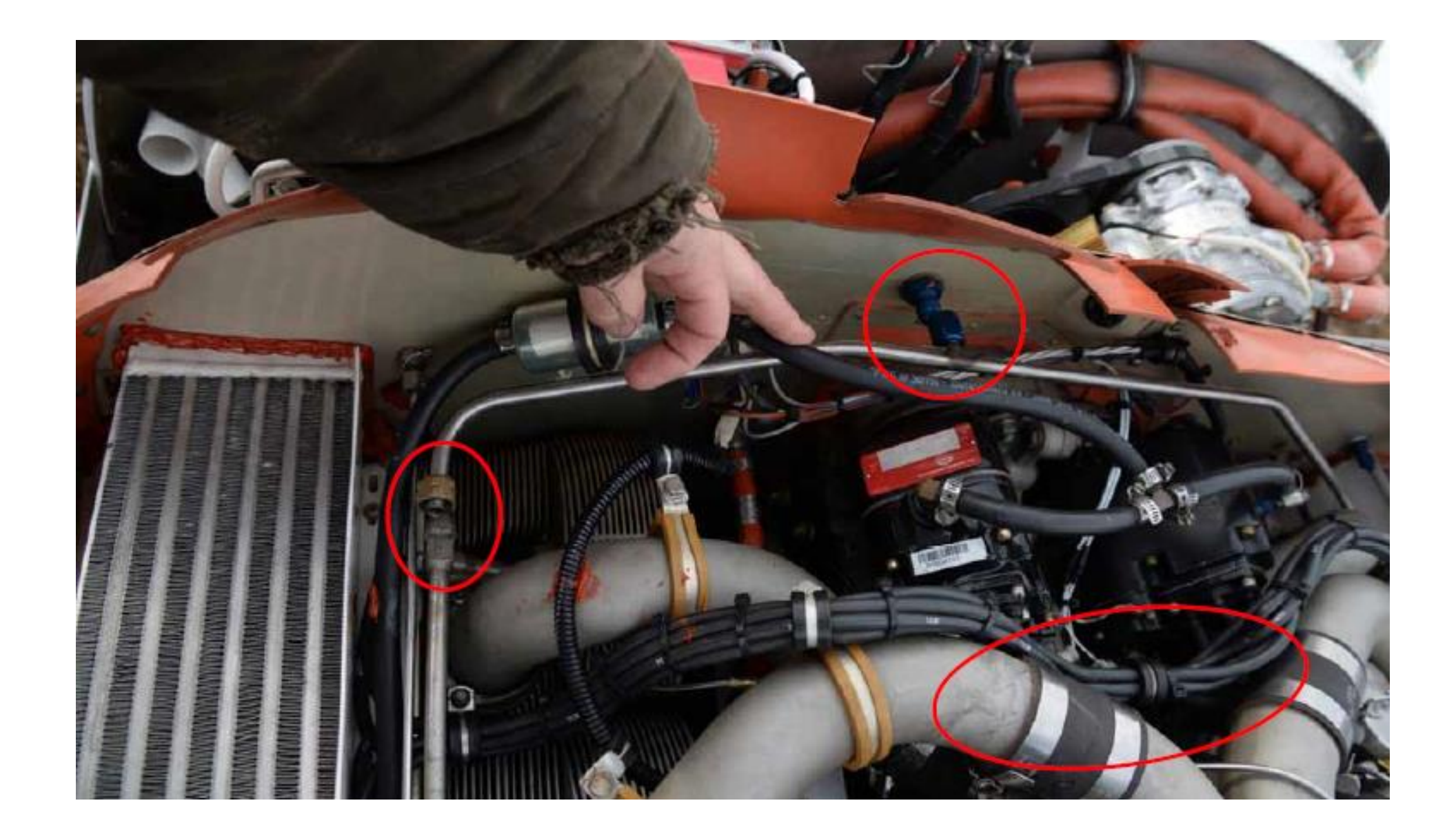
Photo 3 – View of disconnected fuel injector air reference line in engine compartment