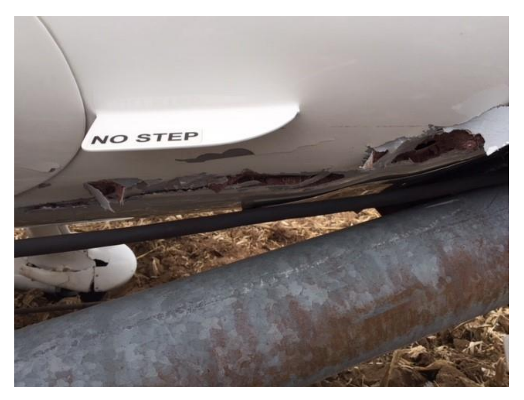
Photo 2 – View of damaged lower fuselage