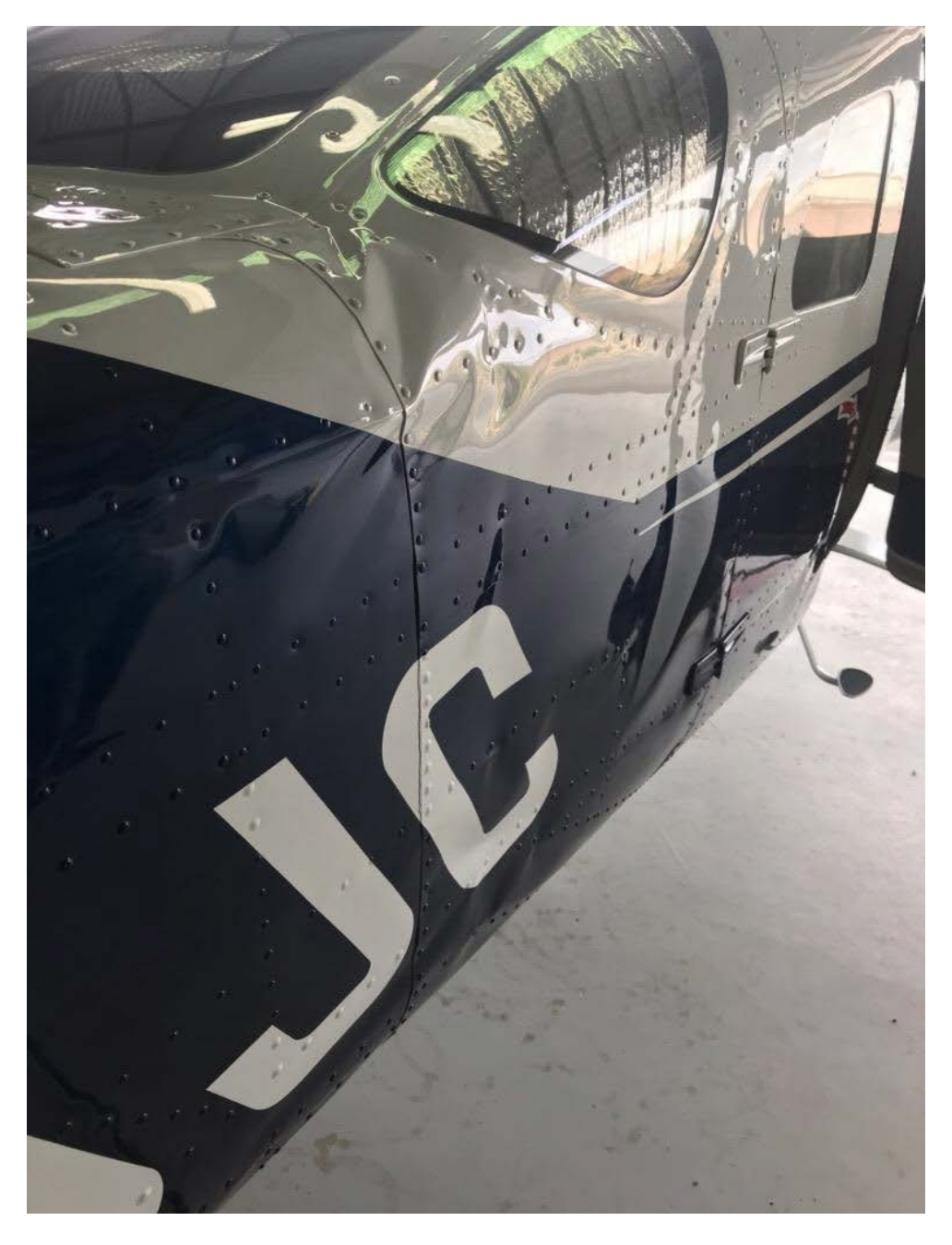
Photo 3 – View of fuselage damage on right side