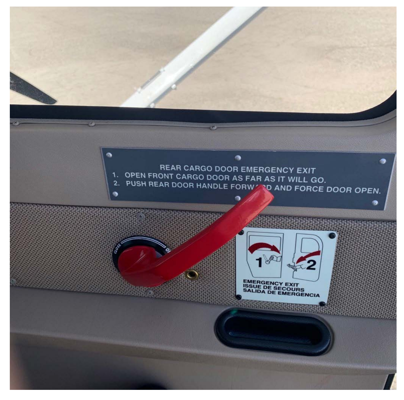
Photo 1 – View of right front passenger door with emergency exit placard