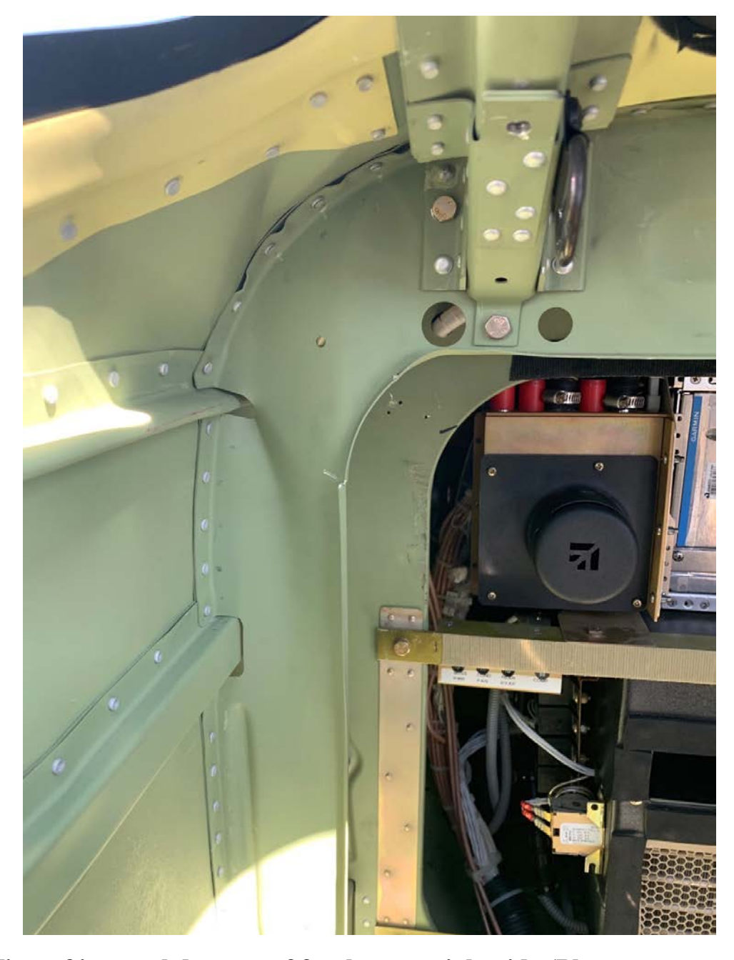
Photo 4 – View of internal damage of fuselage on right side