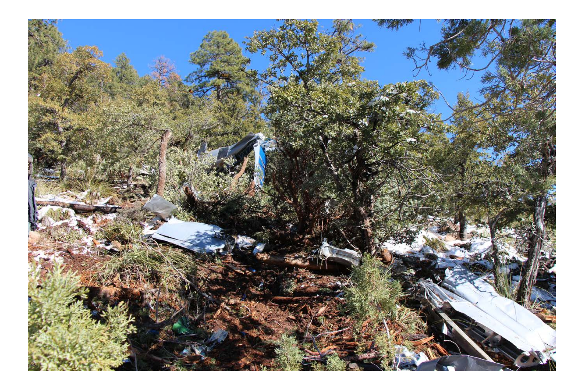
Photo 1 – View of Fuselage and Tail from the Southwest with Wings in the Foreground