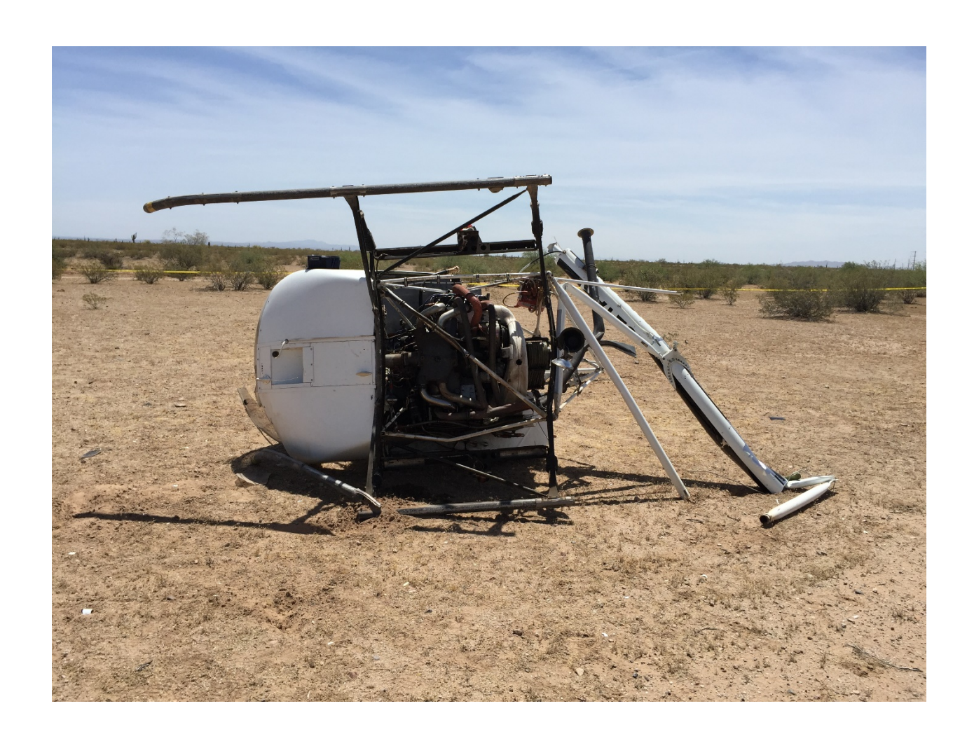
Figure 1 – Bottom View of Wreckage