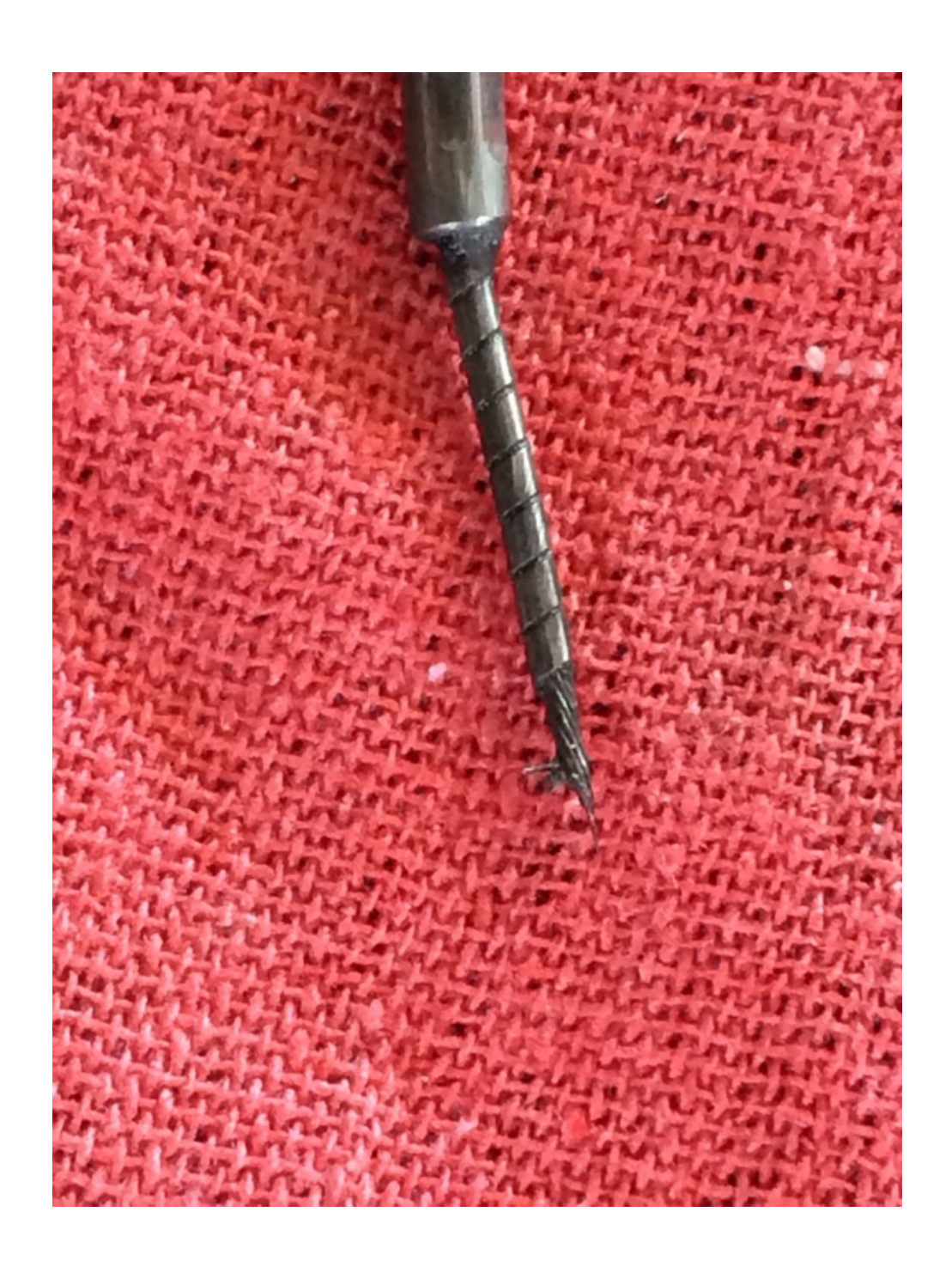
Figure 4 – Throttle Cable Separated End