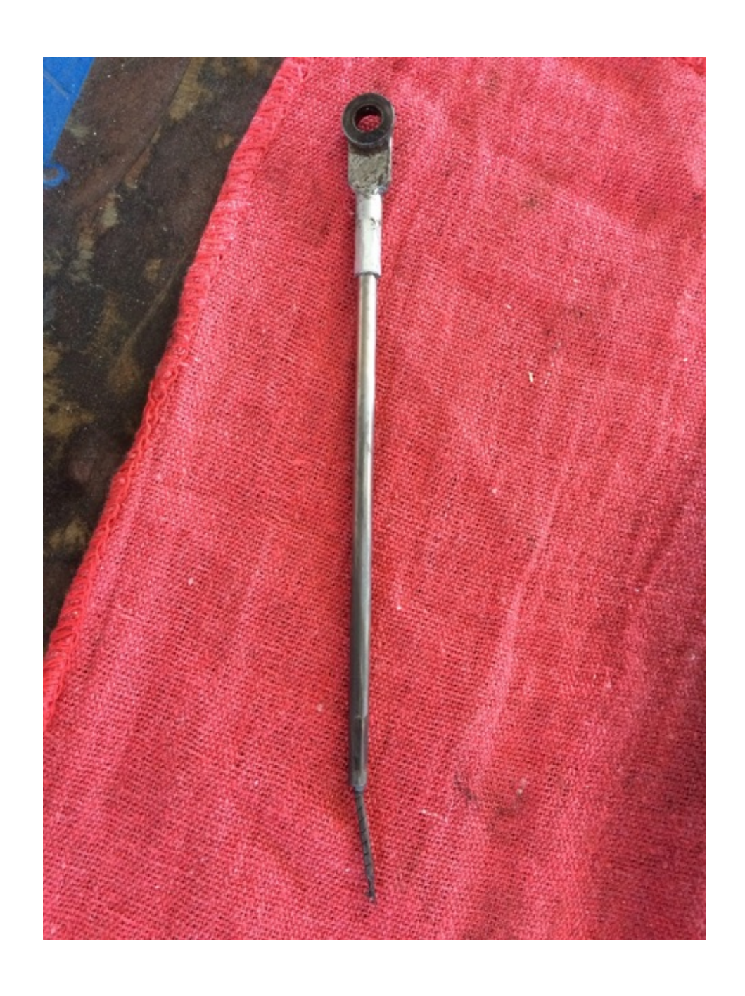
Figure 3 – Throttle Cable