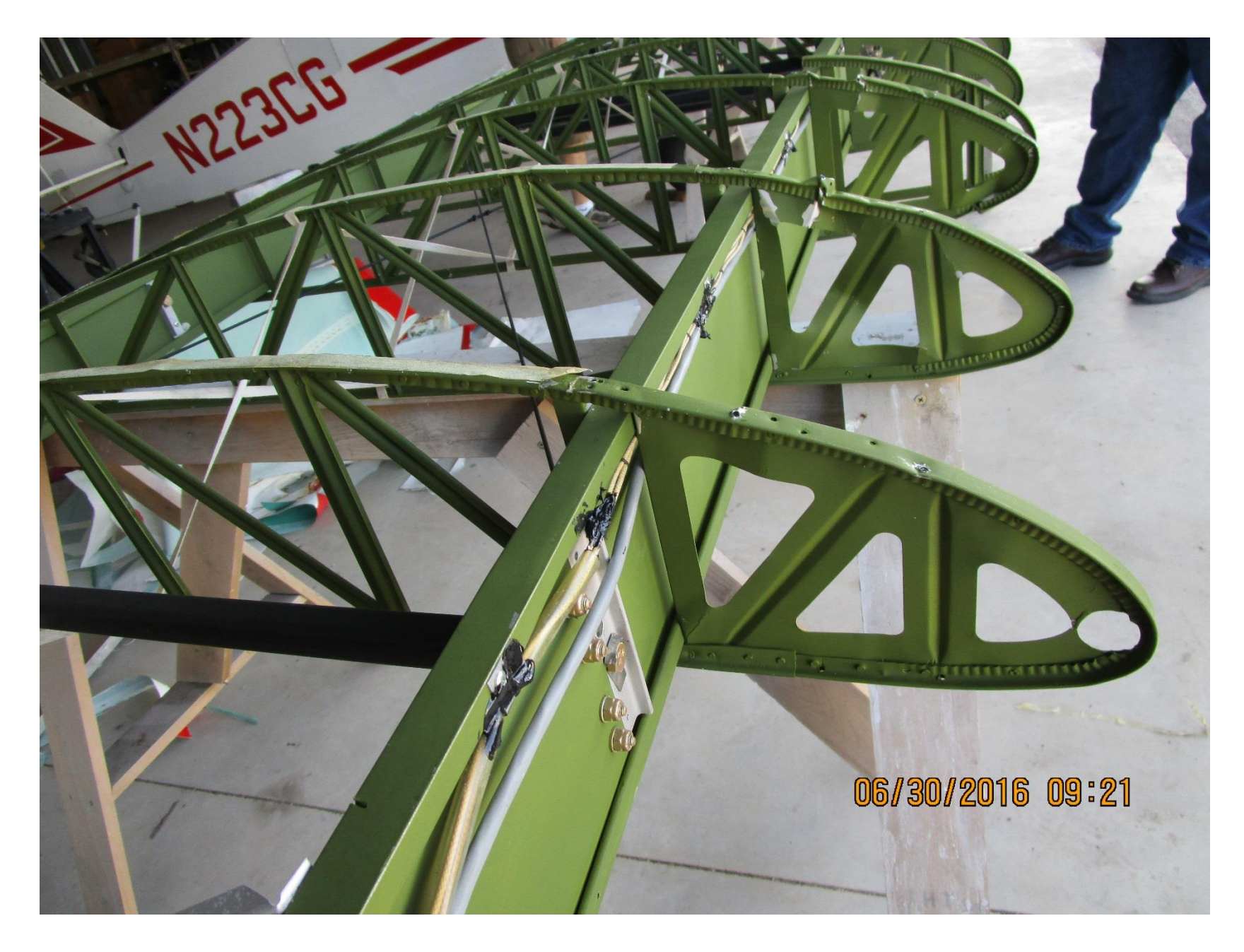
Photo 1 – View of damaged right wing ribs