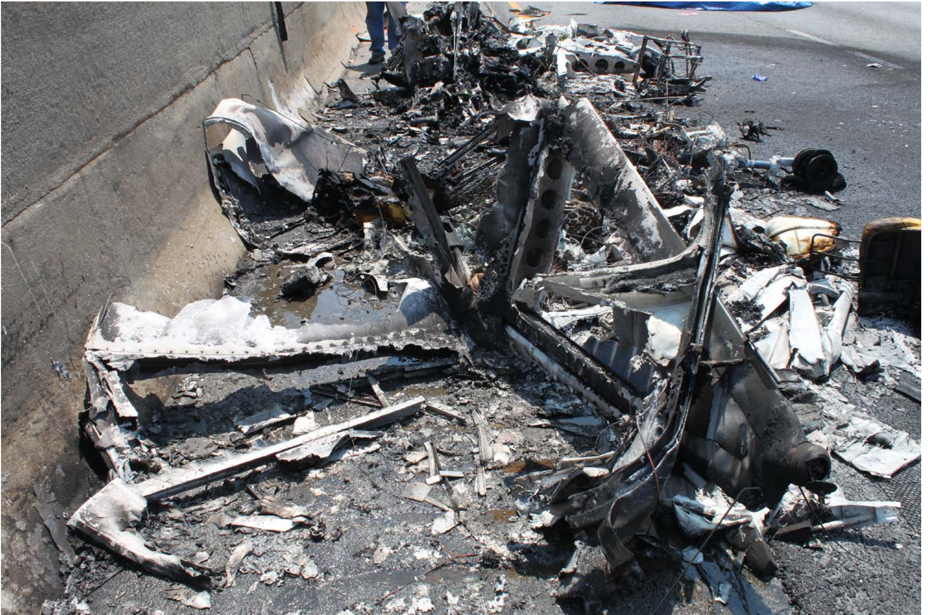
Photo 10 – View of vertical and left horizontal stabilizer fire damaged