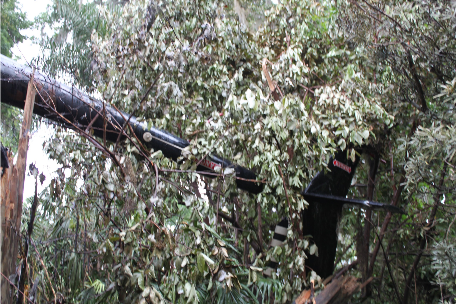
Photo 4 – View of tail boom vertical fins and rotor blades in tree