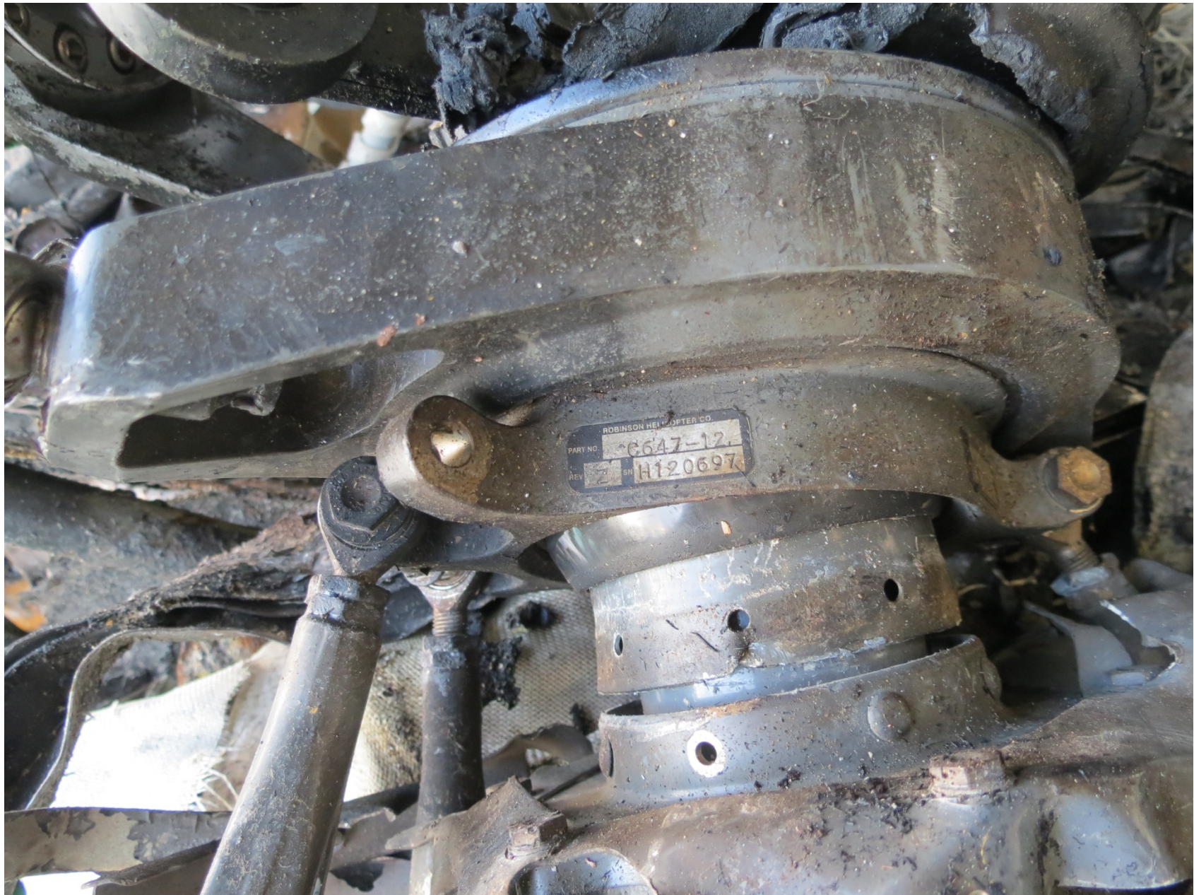
Photo 19 – View of main rotor head/swash plate with missing pitch control linkage