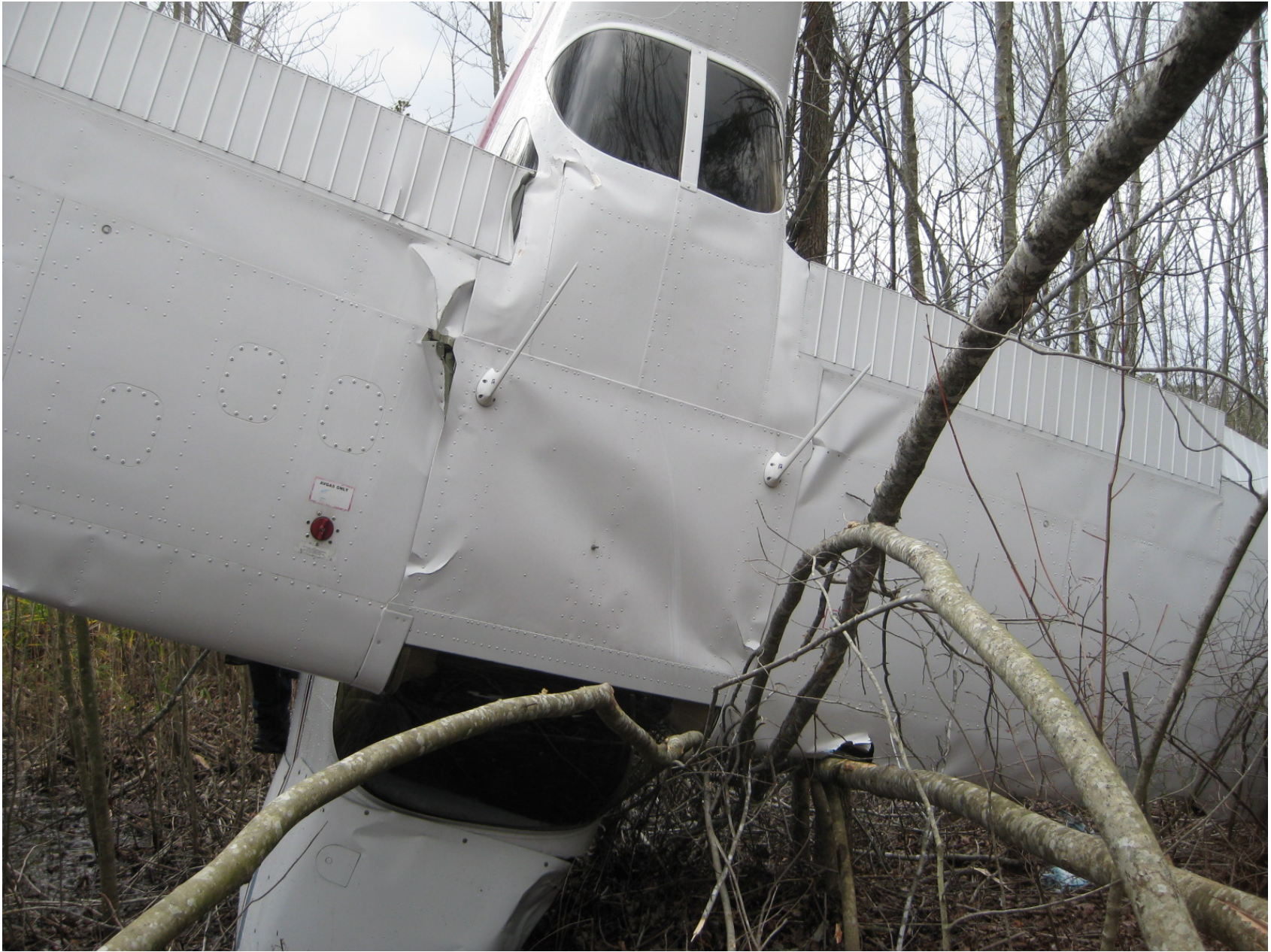
Photo 3 - View of buckled upper fuselage