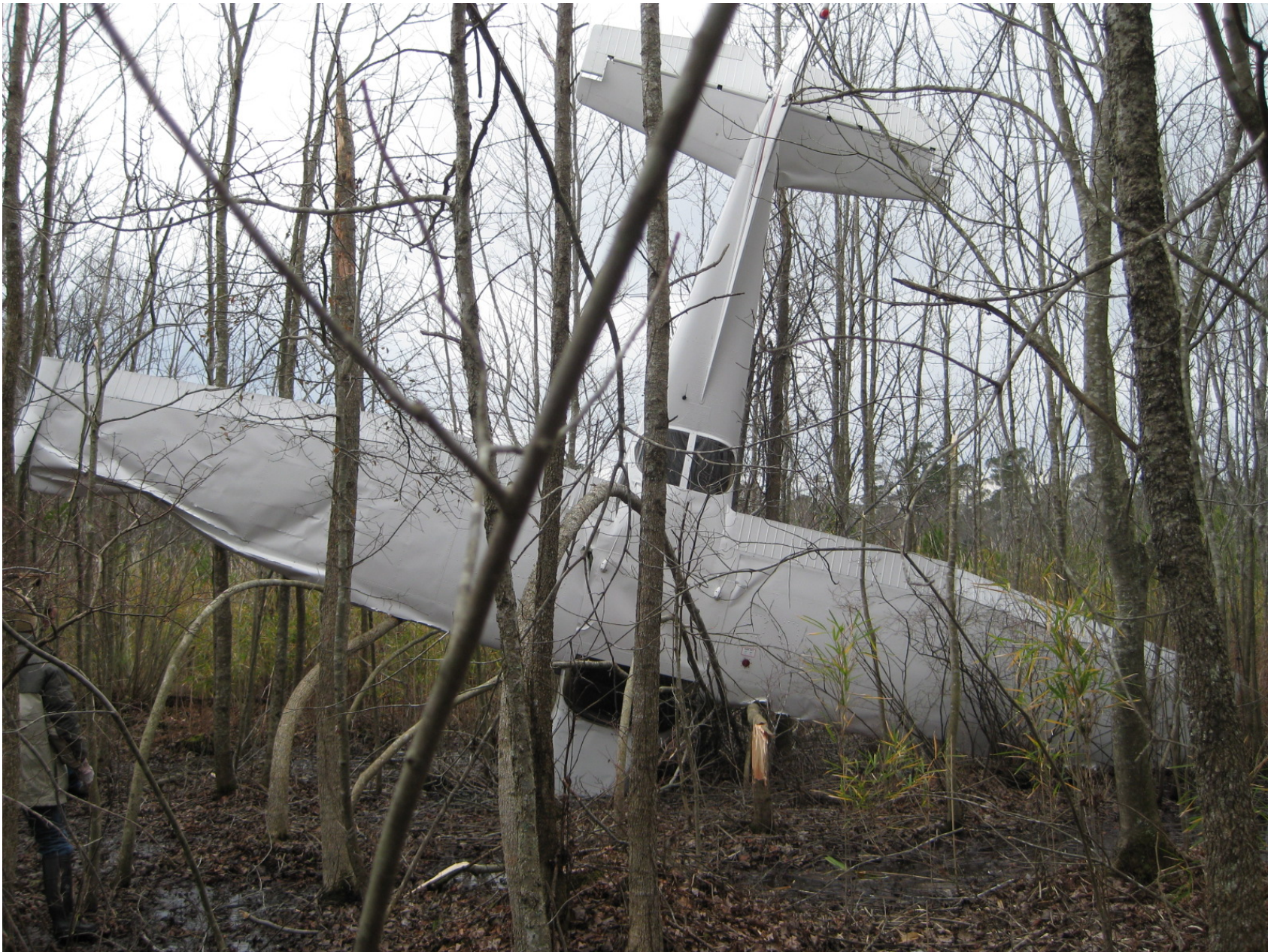
Photo 4 - Forward view of upper fuselage of entire airplane