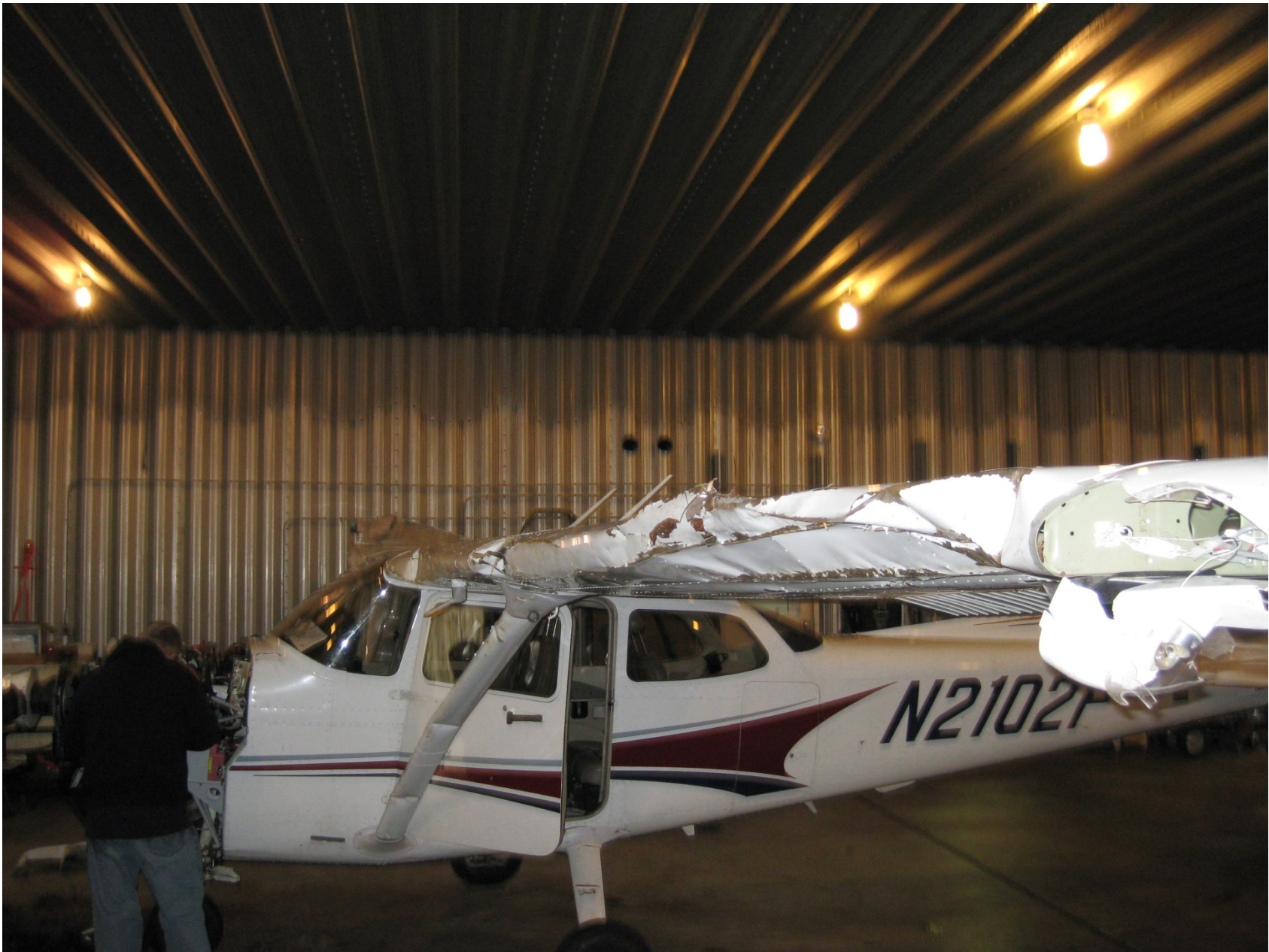
Photo 6 - View of damaged right wing