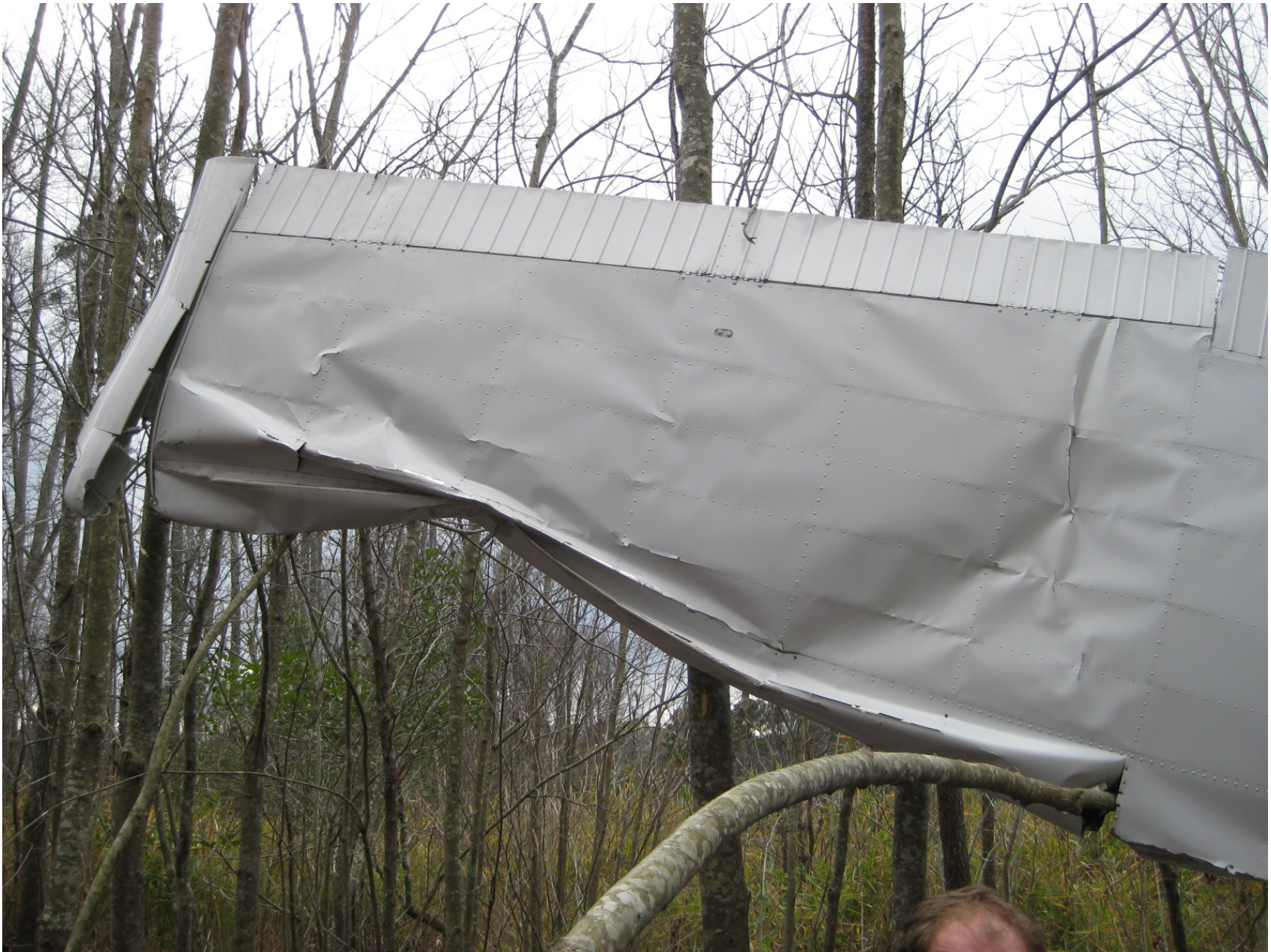
Photo 2 - View of buckled right wing leading edge