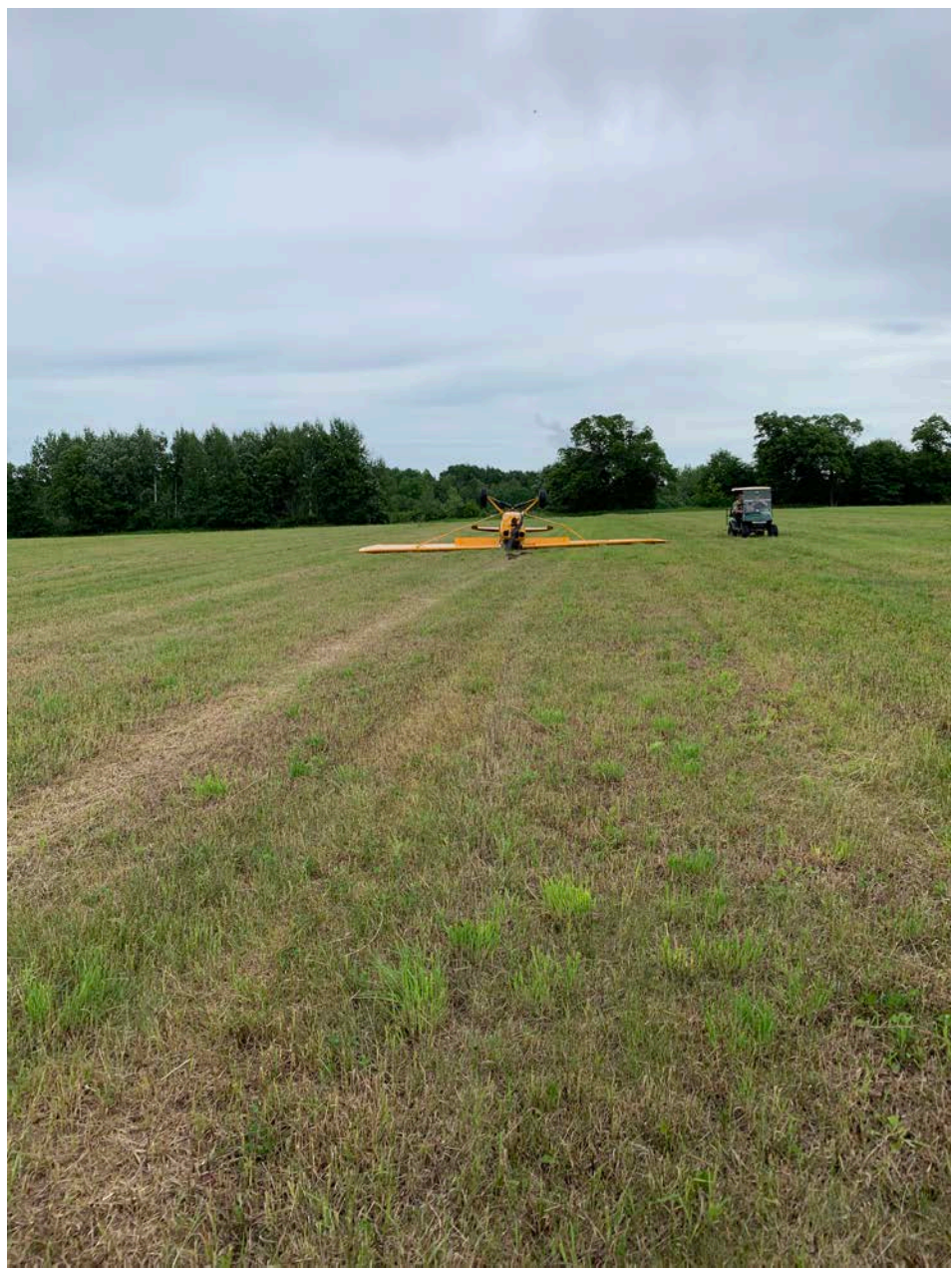
Photo 2 – View towards the departure end of the airstrip and the overturned airplane