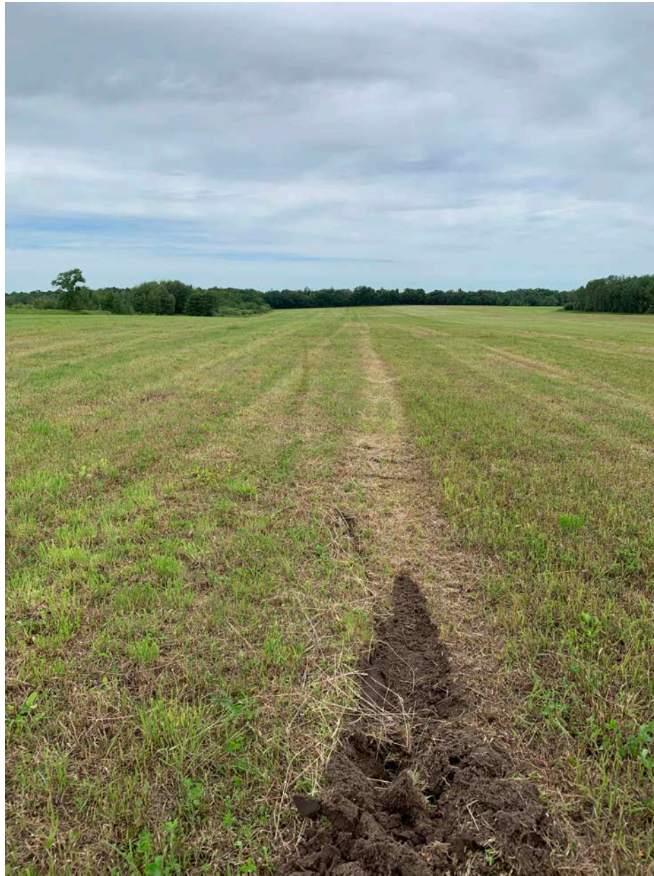
Photo 1 – View towards the approach end of the airstrip