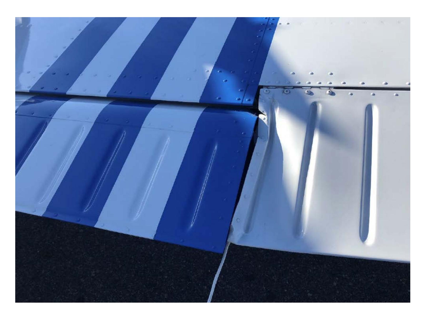
Photo 2 – View of Left Flap and Aileron