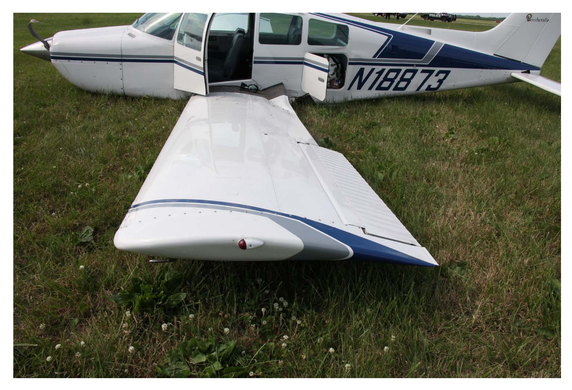
Photo 2 – View of the left side of the airplane.