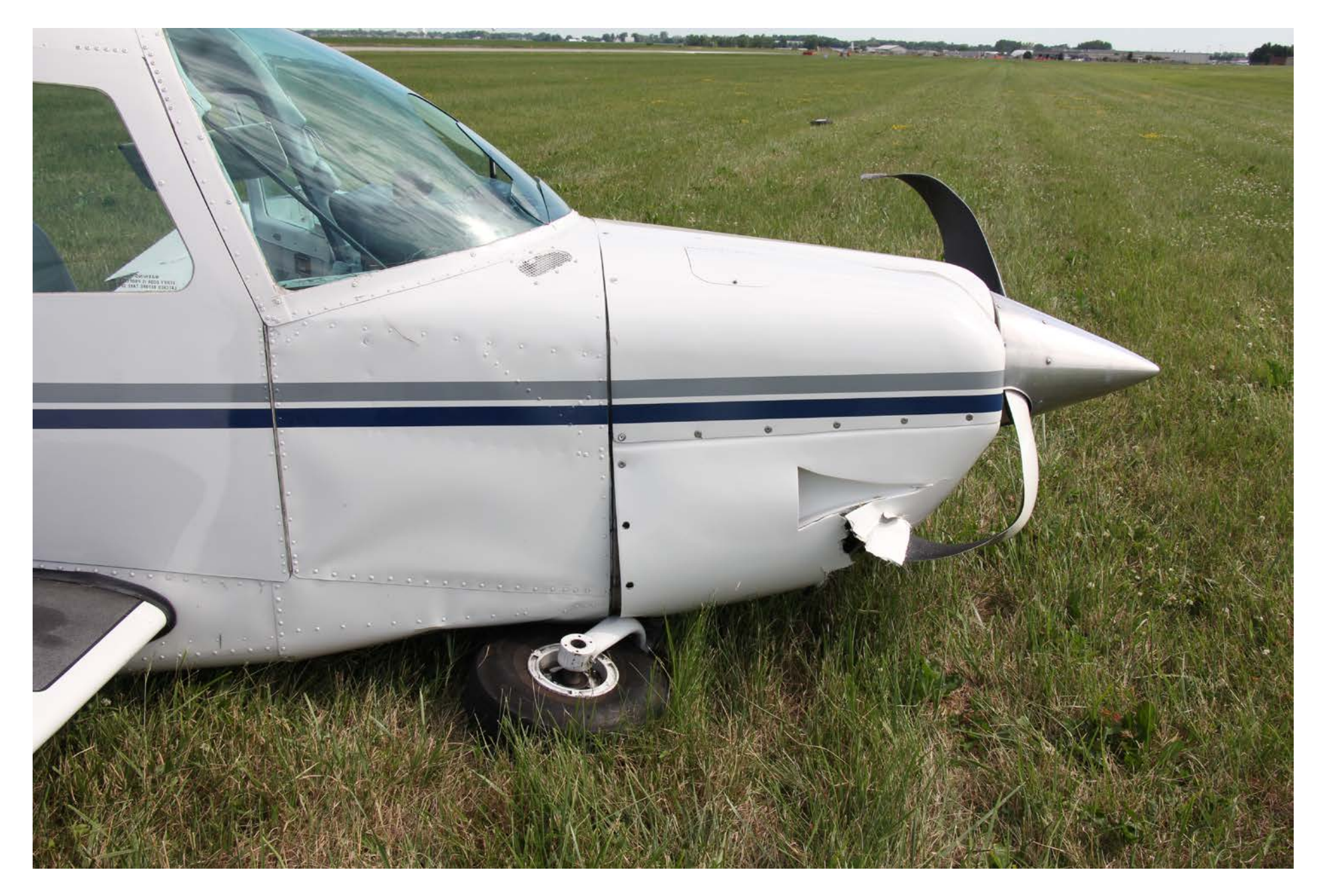
Photo 3 – View of the front of the airplane (courtesy of the Federal Aviation Administration).