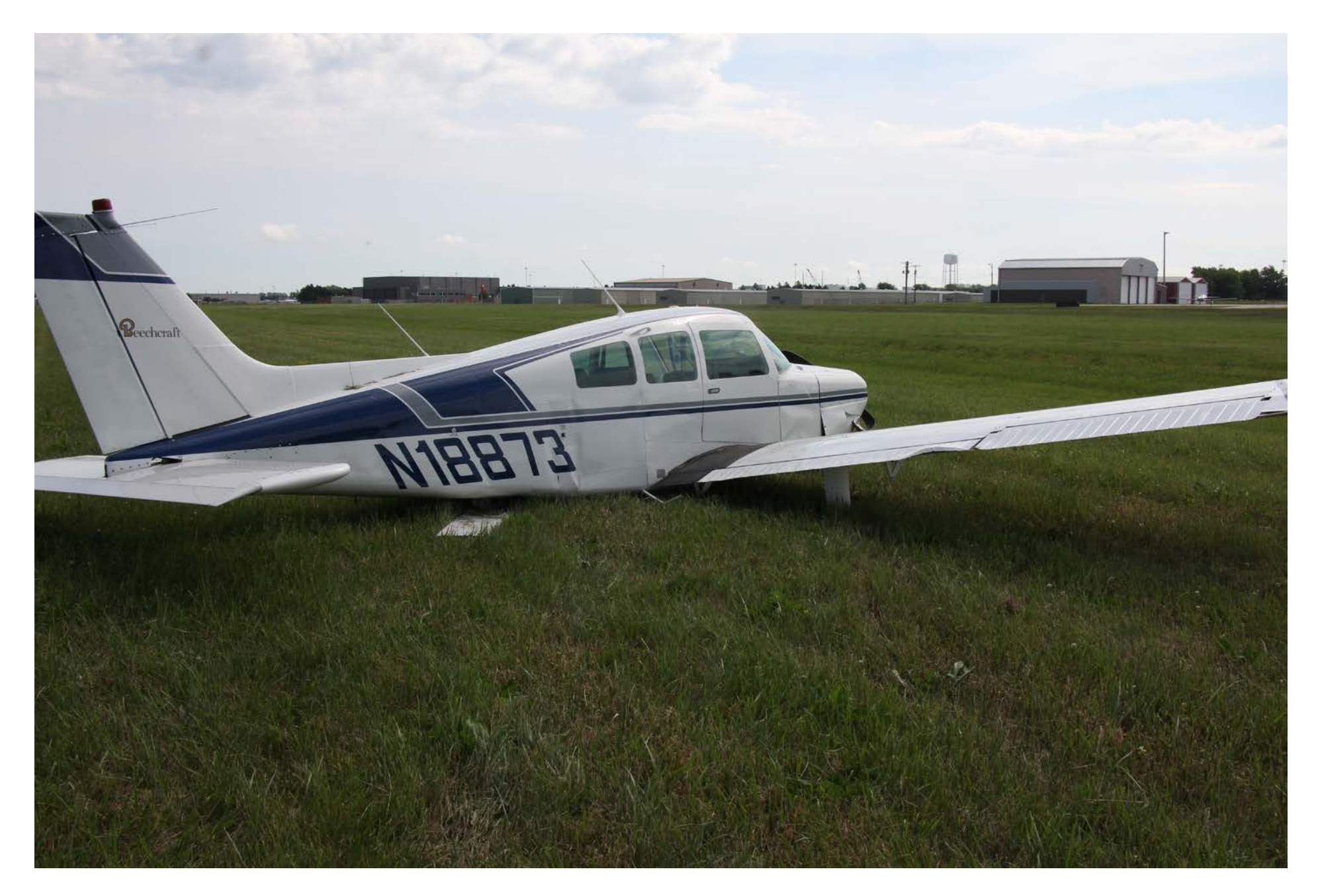
Photo 1 – View of the right side of the airplane.