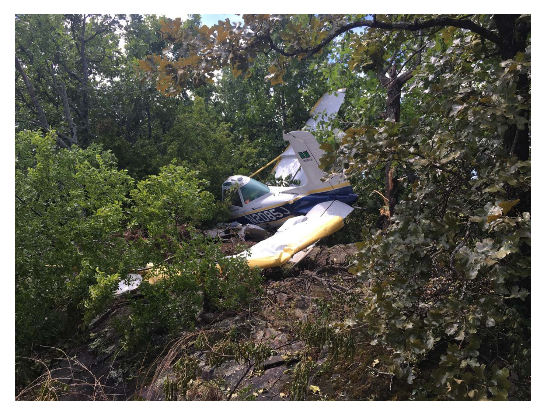
Photo 1 – View of the rear of the airplane.