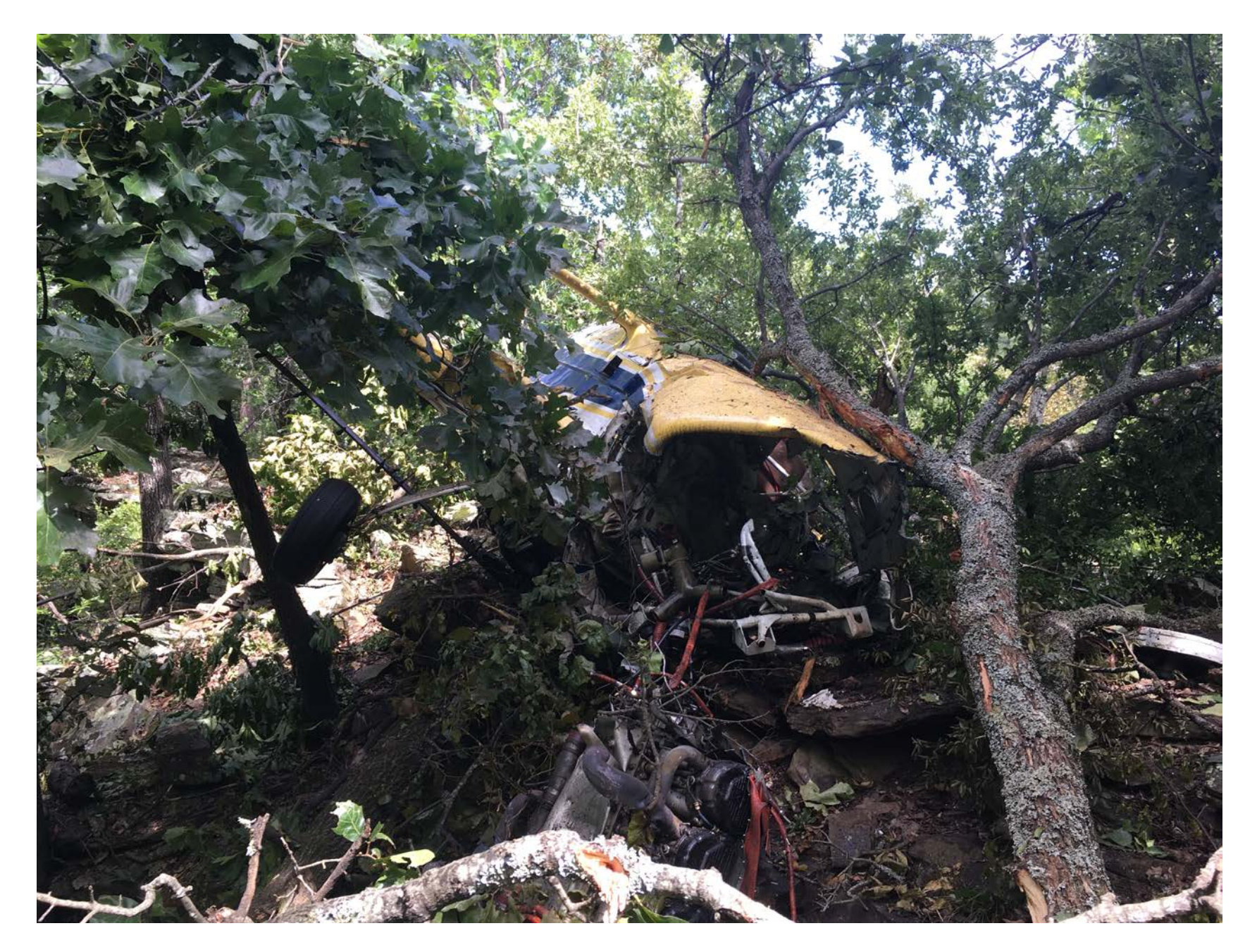
Photo 2 – View of the front of the airplane.