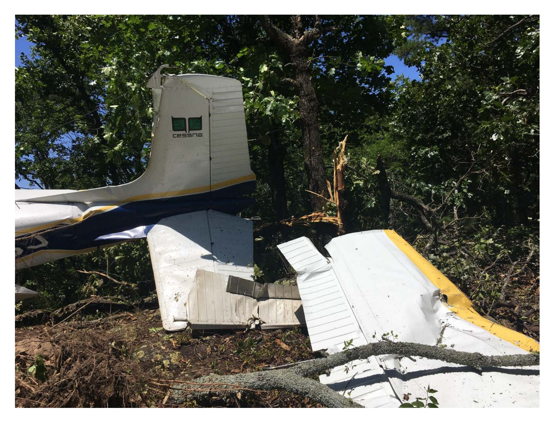
Photo 4 – View of the empennage and the left wing.