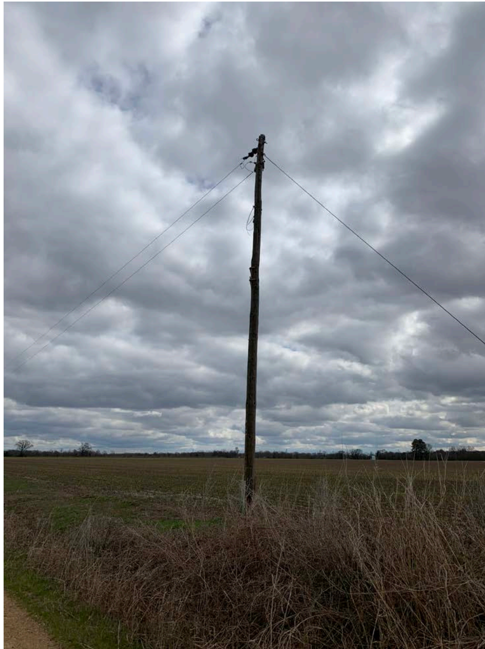
Photo 5 – View of the wood power line pole in the field.