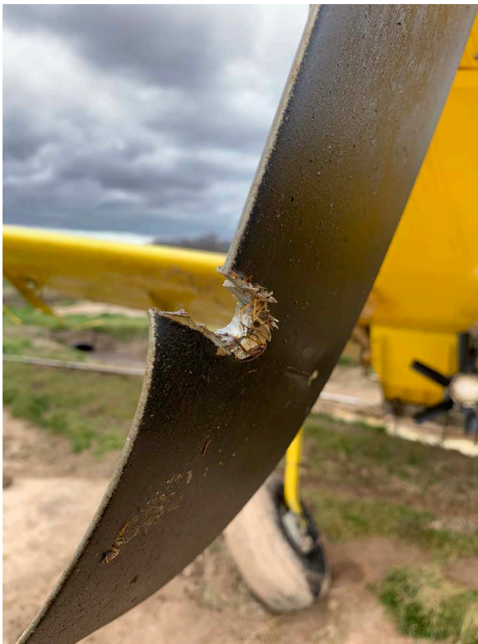
Photo 4 – View of the damage to one of the metal propeller blades.