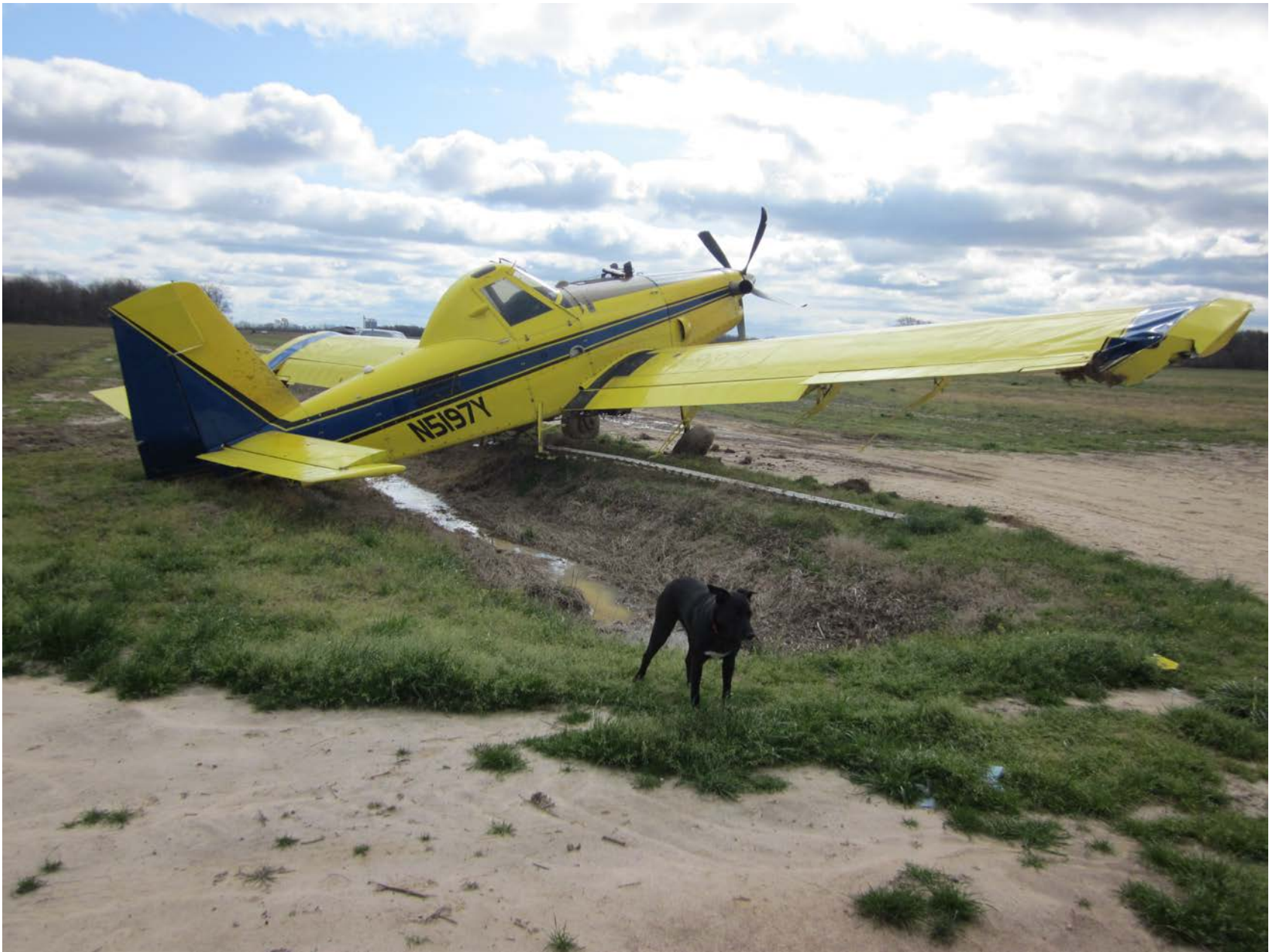
Photo 2 – View of the airplane after it came to rest.