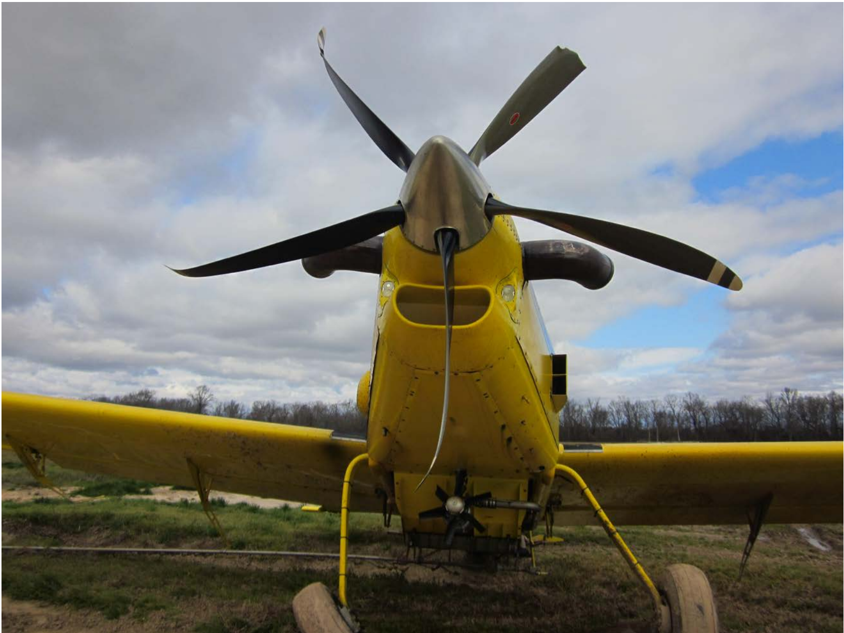
Photo 3 – View of the airplane after it came to rest.