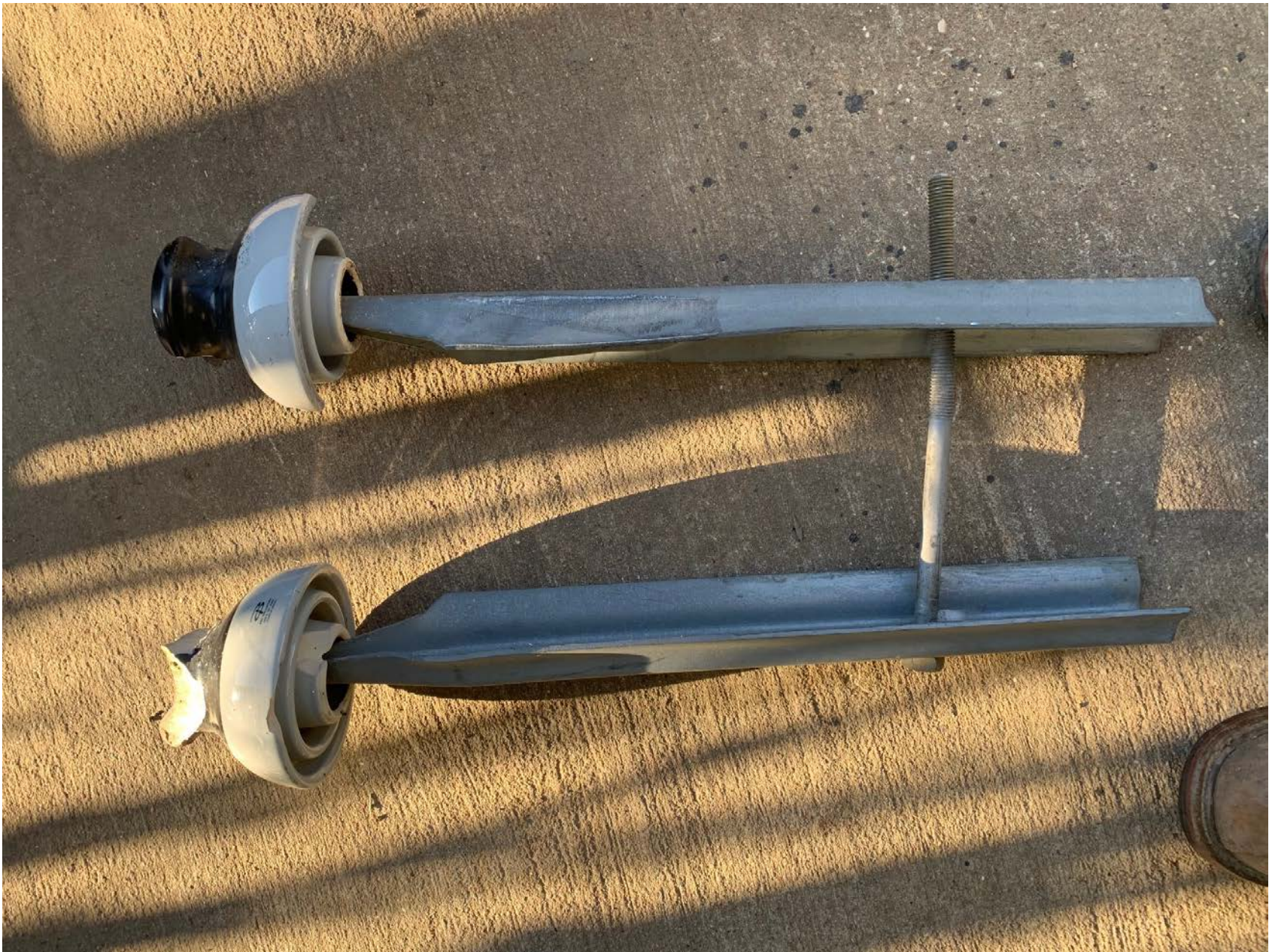
Photo 6 – View of the metal bracket that was mounted on top of the wood power line pole (courtesy of the Federal Aviation Administration).