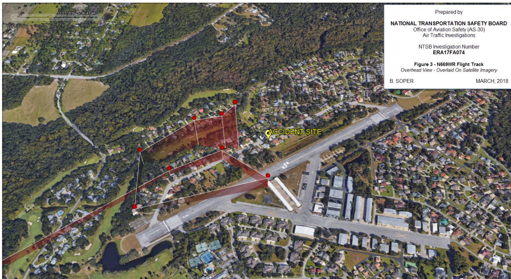
Figure 3 - Radar flight track of N669WR, final segment during the attempt to land at Spruce Creek Airport (7FL6). Viewed from above at a slight angle and overlaid on satellite imagery with the top of the figure being north. Radar data provided by the FAA.