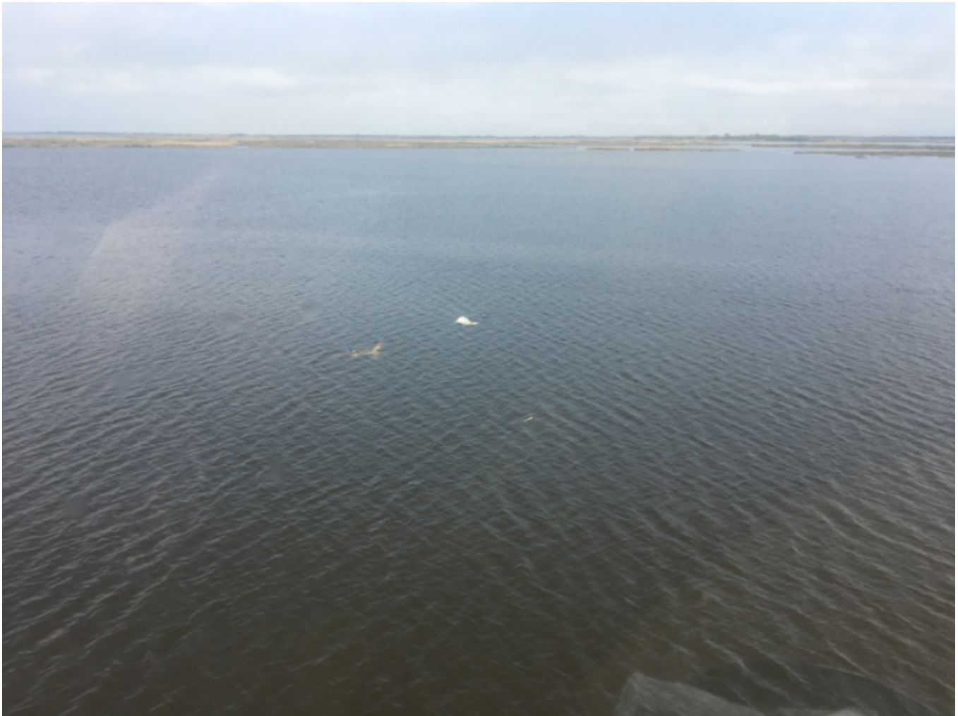
Figure 2: Wreckage Site Viewed Toward Northeast

The wreckage was located in a brackish marsh. Terrain features in day visual meteorological conditions are depicted in Figure 2.