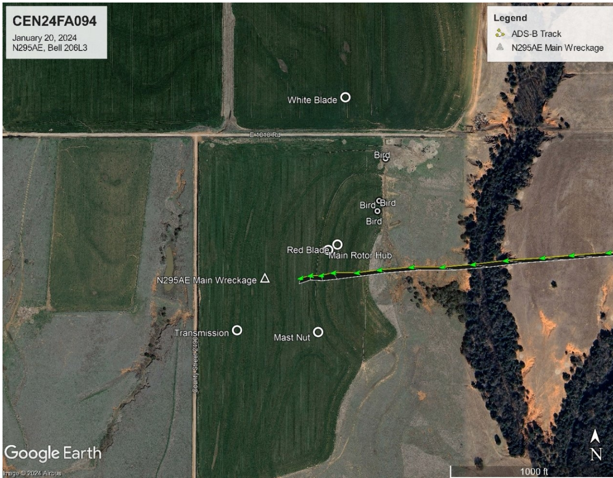
Figure 1. ADS-B Flight Track with Wreckage and Bird Locations