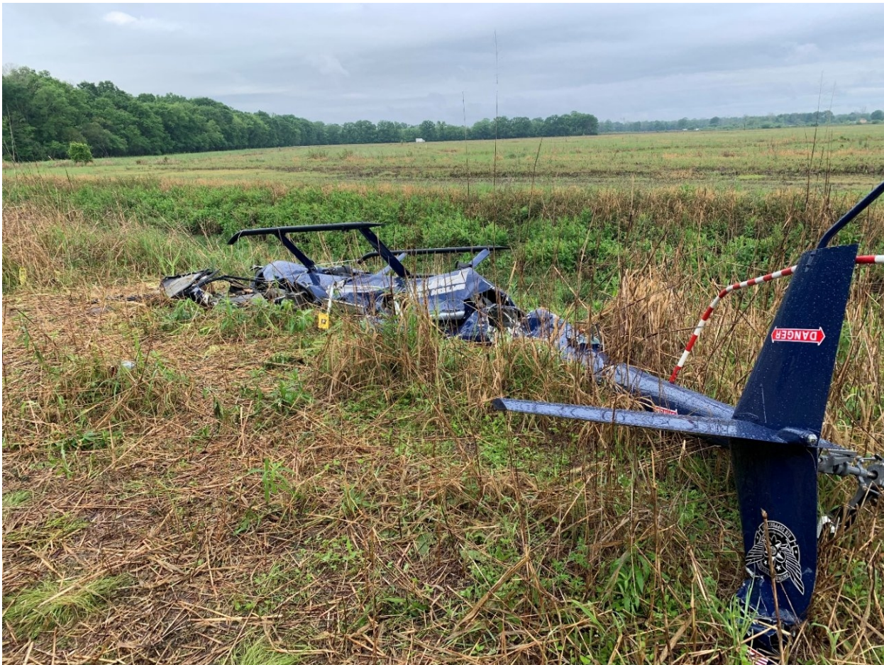
Figure 3. Main wreckage at accident site.

The main wreckage, which consisted of the cockpit, fuselage, and tailcone, came to rest inverted next to an irrigation ditch at the edge of a sugar cane field (see Figure 3).