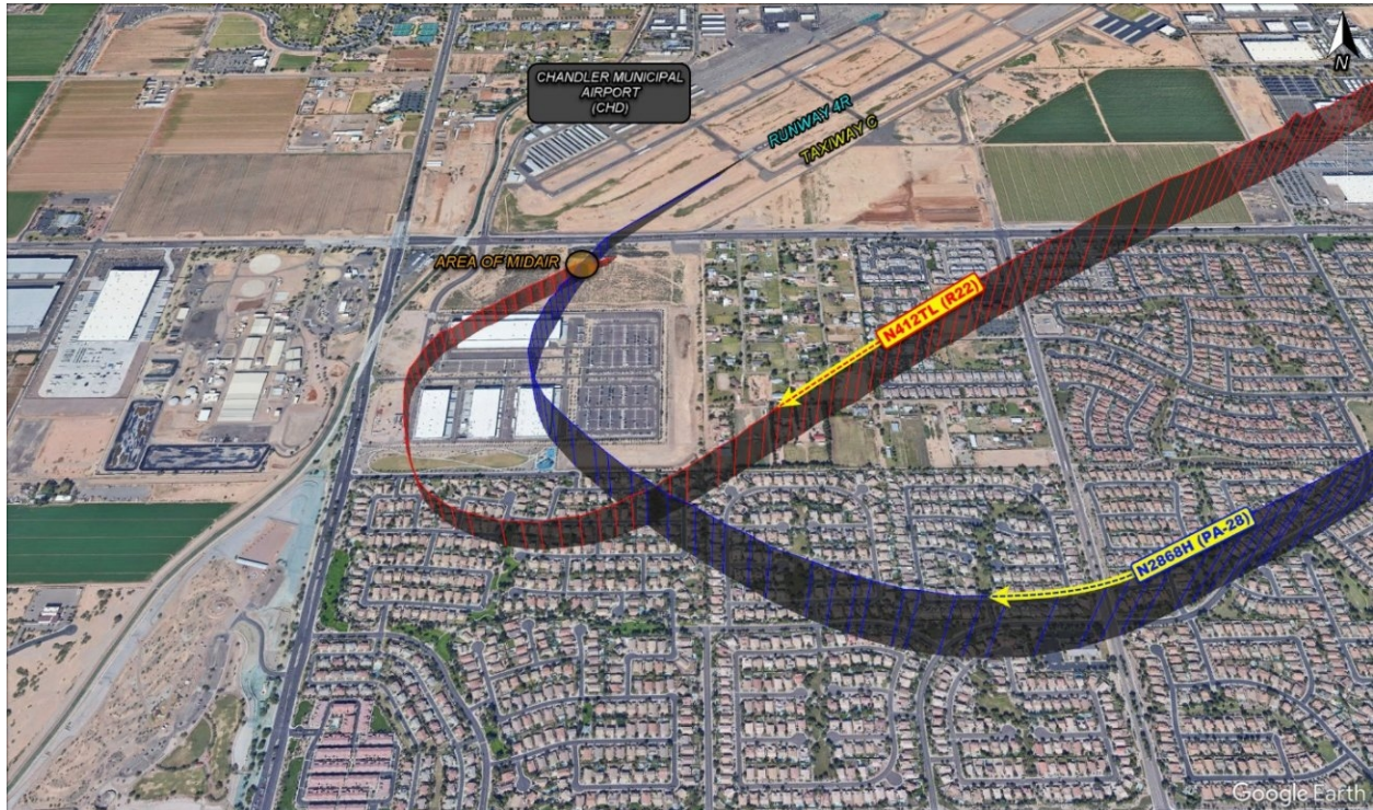
Figure 1. View of helicopter and airplane ADS-B flight track data

Recorded Automatic Dependent Surveillance-Broadcast (ADS-B) data provided by the Federal Aviation Administration (FAA) showed that both aircraft appeared to be on a base to final turn, with the airplane on the approach to runway 04R and the helicopter on the approach to taxiway C (parallel to and to the right of runway 04R). The data showed that the flight paths of the aircraft intersected about 0740:15 at an altitude of about 1,400 ft mean sea level (msl), as seen in Figure 1.